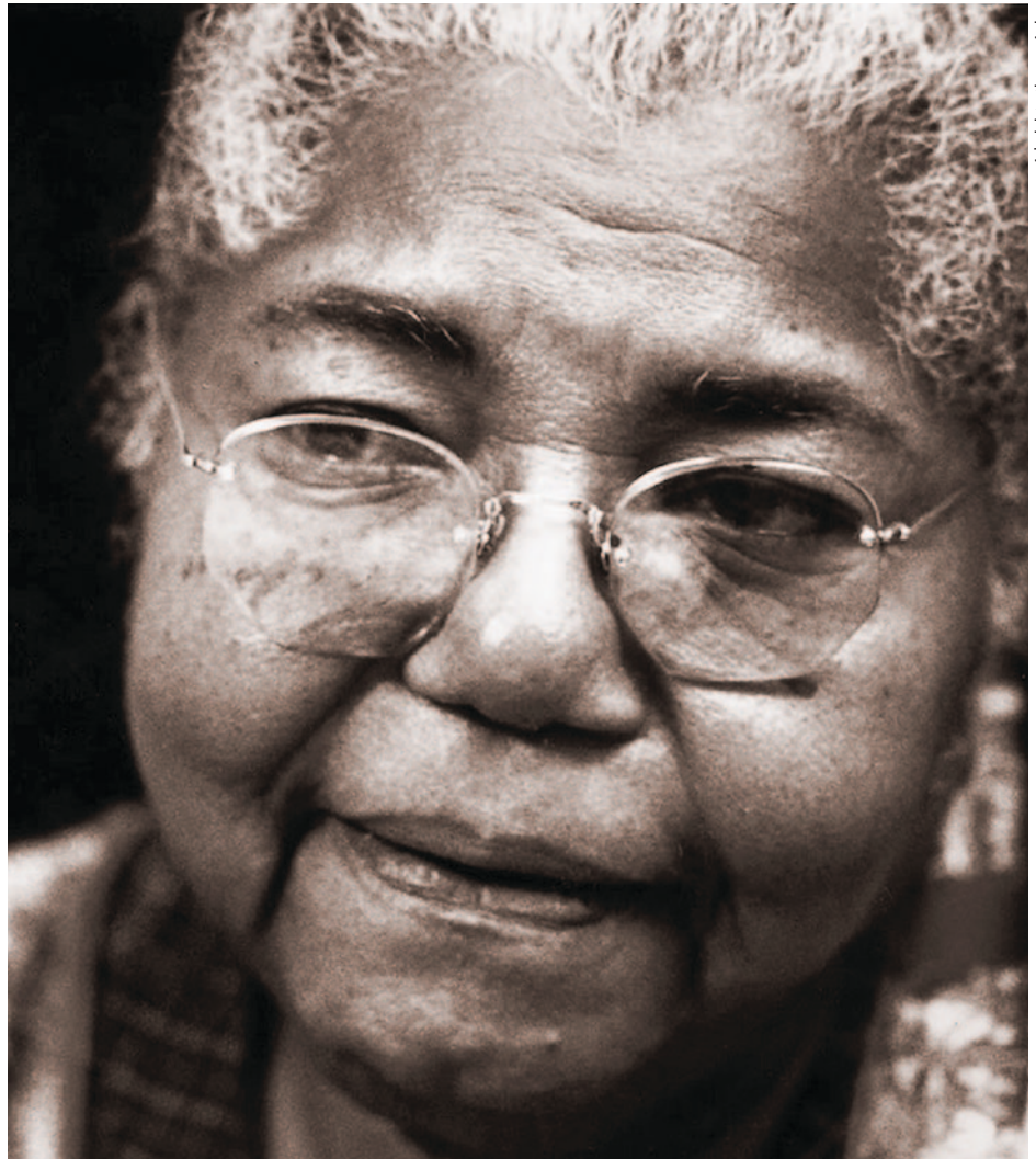
Administration on Aging

These increases do not come without costs; they are accompanied by corresponding increases in both the incidence (new cases) and prevalence (current cases) of chronic health conditions, most commonly cardiovascular disease, arthritis, diabetes and cancer. These chronic health problems may greatly influence older adults' well-being and productivity, as disability rates increase dramatically after age 65. One quarter (25.5%) of U.S. adults over age 65 report that their daily activities are limited by one or more chronic health condition, but 43.9% of those over age 75 report similar limitations (NCHS 2006). However, many older adults are in good or excellent health