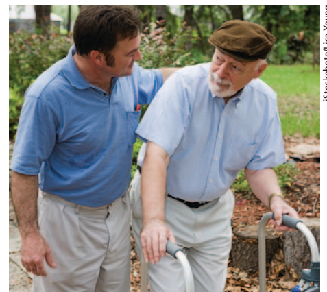
In standardized stress inventories, middle-aged adults reported family issues such as their parents’ health as stressors, while older adults reported that their own health problems and “daily hassles” were stressful.

Nonetheless, studies using the DLS data showed that there are age differences in the types of problems reported as “low points” by young versus