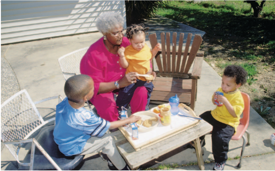
Adults often face multiple challenges as they age — such as providing full-time care for grandchildren — but on the whole they report less stress than younger adults.

might have the same odds of getting breast cancer as a woman who has not. However, if both women get cancer, it might progress more quickly in the one with the high level of chronic stress.