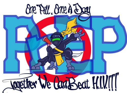
Fig. 1 PrEP marketing image developed by BHCHP PrEP program participants and a collaborating syringe service program.

Participants also described being referred to PrEP services while "getting blood work done" through street-based outreach or from the addiction treatment nurse "who sees me daily and knows about my lifestyle," representing comfortable, familiar environments. Another clinician emphasized the significance of street-based PrEP screening: "More providers