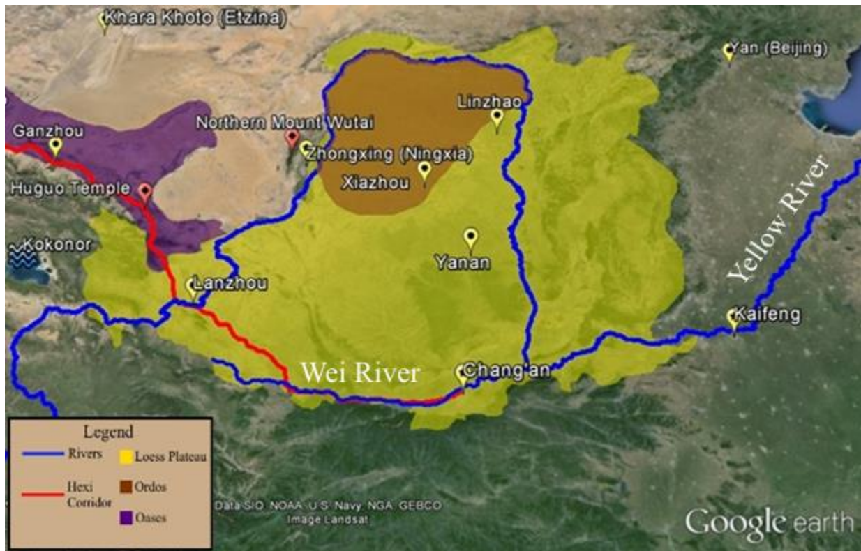
Figure 1: A map of relevant geographic features, cities, and places of interest around the epicenter of the Tangut state.

The Ordos in the northwest corner of the plateau followed the same climactic variation as the Loess Plateau, trending more arid. During drier times, the Ordos was experienced significant desertification with moving sand predominant while in warmer, wetter times the region resembled a steppe grassland. 11 Since this region is also part of the Loess Plateau, concentrations of loess is common. During the Holocene Era, the bounds of desert in the Ordos have waxed and waned due to climate variation.