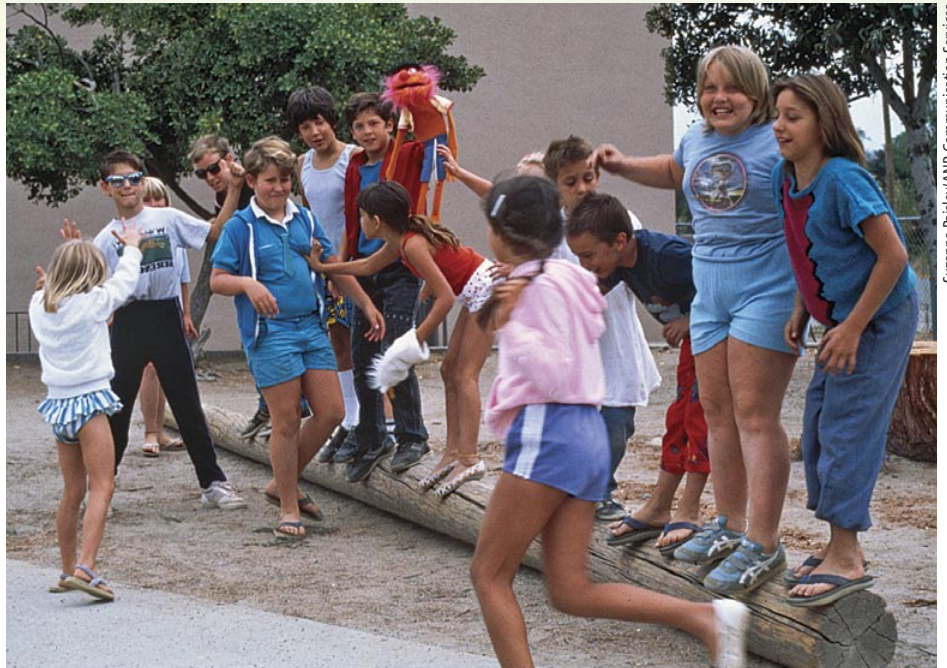
Children have been gaining weight in recent decades due to factors such as the school environment, community design and safety concerns that discourage outdoor play, and diets increasingly heavy in sugar and fat.

I N the late 1990s, UC Cooperative Extension nutrition specialists and Experiment Station faculty began to notice a dramatic increase in overweight children in California. Pediatric overweight had become "epidemic": its prevalence had tripled from 5% to 15% over the preceding 30 years and rates were significantly higher for minority children, especially those from low-income families (fig. 1) (Troiano and Flegal 1998). Overweight children