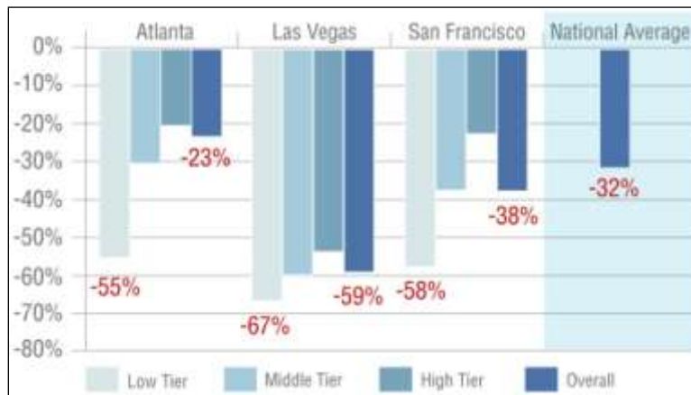
Figure 2. Case-Shiller 20-City Composite Home Price Index January 2007 to June 2011 in three major U.S. cities, tiered by initial property value

recession and their primary residences have lost a greater percentage of property value as compared to the homes of their wealthier peers (see Figure 2). 15