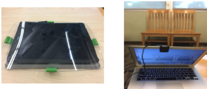
Figure 2. Setup of the iPad and screen protector, and the recording laptop and camera

During the study, a child-parent pair was invited to one of the experiment settings to watch the Storytime video on an iPad, covered in a protected screen. The parent and the child were asked to sit side-by-side, as how they typically engage in story time together. All interactions were video-recorded from an external camera installed on a Macbook Air laptop computer, placed across from the child (Figure 2). The lead researcher used a remote control to pause the video after each question was presented and waited for the child to verbally give an answer to the question before proceeding to the next story line or question. In order to obtain a non-interrupted and naturalistic speech sample from the child, the parent was asked not to verbally or non-verbally prompt the child throughout the study. During incidents when the child is unable to answer specific questions, the lead researcher will either repeat the question or verbally prompt the child to respond.