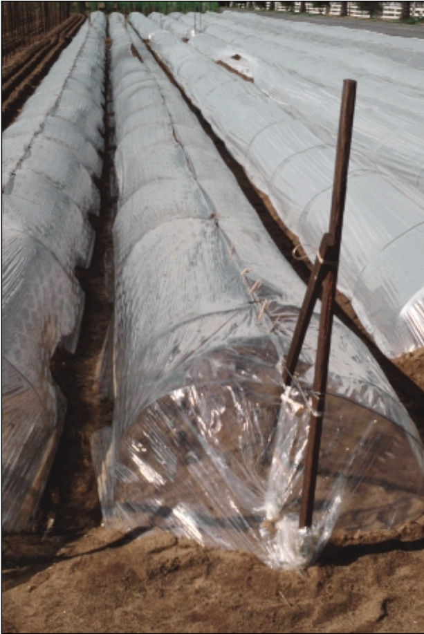
Figure 2. Completed tunnel row covers.

plastic and over the supporting bottom hoop. This outside hoop keeps the plastic from flapping and tearing in the wind. Where severe winds are a problem, “twistems” are used to secure the top hoop, bottom hoop, and apical wire together. This reinforced construction has weathered even moderately heavy storms.