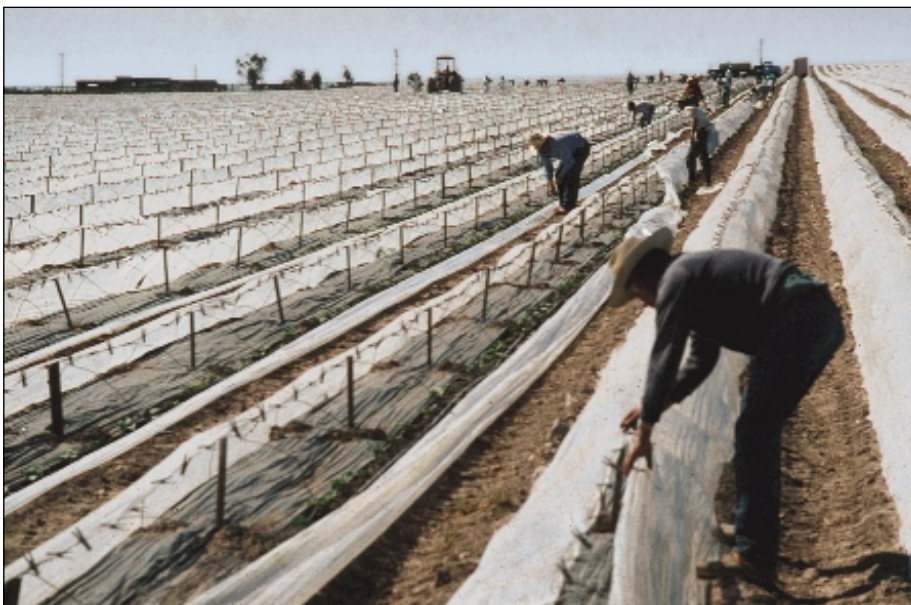
Figure 1. Workers construct tunnel row covers to protect cucumbers from low temperatures and wind.

sheets are pulled up to cover the hoops forming a tunnel. At the top of the tunnel, the two sheets overlap 3 to 4 inches (8 to 10 cm) and are pinned to the apical wire with strong clothespins (figs. 1 and 2). Three or four pins are used between stakes. In windy areas, row covers should be constructed with extra hoops placed around the outside of the