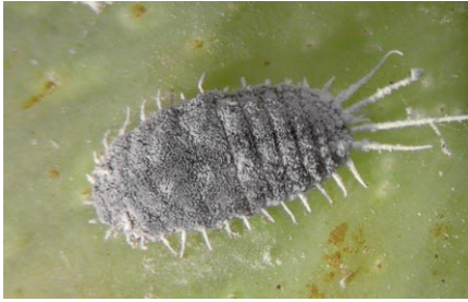
Figure 3. The grape mealybug is sometimes found on pistachios but is not of economic importance. It can be distinguished from Gill's mealybug by its longer tails, lateral filaments, and lack of long, glassy rods.