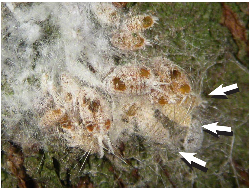
Figure 15. Mealybugs parasitized by one or more wasps will stop feeding, begin to bloat and turn yellow (arrows), and then turn an amber brown color. When parasitoids are fully developed, they chew a round exit hole in the side of the mealybug mummy.