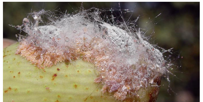
Figure 9. During the summer, adult females of Gill's mealybug produce large numbers of crawlers that aggregate and feed near their mothers.