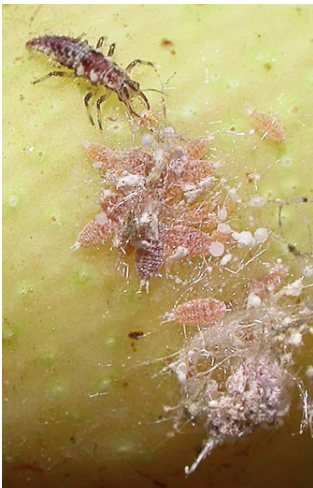
Figure 12. Green lacewing larva feeding on mealybug nymphs.

Several species of predators and parasitoids can suppress Gill's mealybug densities. Predators include green lacewings (fig. 12) and a small brown coccinellid (ladybird) beetle whose larva mimics the appearance of a mealybug (figs. 13 and 14). Parasitoids include wasps in the genera Pseudaphycus , Chrysoplatycerus , and Anagyrus (fig. 15). These parasitoid species have been shown to effectively reduce Gill's mealybug populations on almond, persimmon, and grape crop systems where pyrethrin-based insecticide use is very limited. However, they are rarely found in pistachios where these insecticides are often used for control of true (hemipteran) bugs.