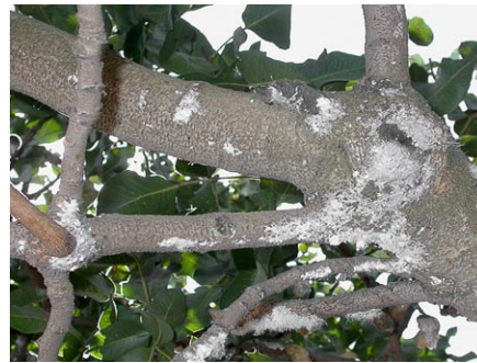
Figure 6. In the fall, Gill's mealybugs aggregate on the trunk and main scaffolds where they give the surface a white, bearded appearance.

Gill's mealybug has three generations per year in California. After harvest, adult female mealybugs migrate to the main tree scaffolds and trunk where they aggregate and give the wood a white, bearded appearance as if draped in cotton candy (fig. 6). Then they produce crawlers that seek out protected places in cracks and crevices to overwinter. During budbreak, the overwintering nymphs migrate to the swelling buds and begin to feed (fig. 7). They continue feeding at the interface between the previous year's wood and the current year's growth until May, when the overwintering mealybugs reach maturity and move to the rachis (fig. 8). Between late May and mid-June the adult females give live birth to crawlers of the first of two in-season generations that feed on the pistachio hull (fig. 9). The first generation is present from early June through mid-July and the second from mid-July through