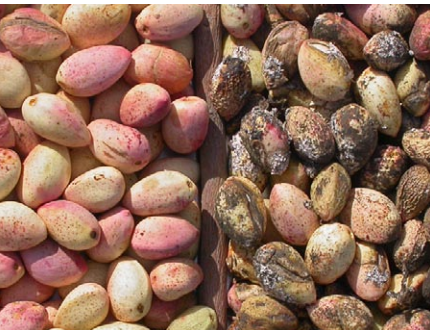
Figure 5. Nuts from uninfested (left) and Gill's mealybug-infested (right) pistachio trees.