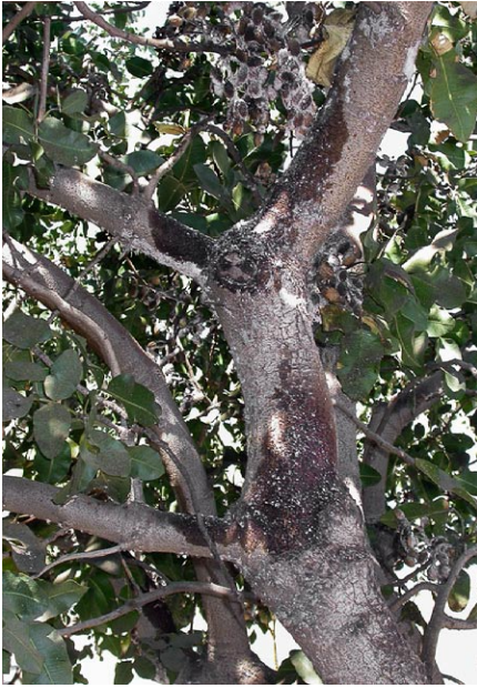
Figure 10. Wet spots from honeydew produced by Gill's mealybug in pistachio.