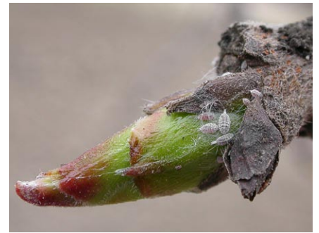
Figure 7. During budbreak the mealybugs migrate to and begin feeding on the swelling bud and developing shoot.