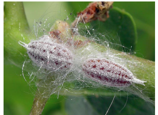
Figure 1. Adult females of Ferrisia gilli have pink bodies and are covered in white wax with bare patches that give the appearance of two stripes down the back. Long, white, glassy rods may also be present, as shown in this photograph.

Gill's mealybug may be confused with the grape mealybug ( Pseudococcus maritimus ), a non-damaging mealybug that is sometimes found on pistachios. The grape mealybug can be distinguished from Gill's mealybug by its longer tails, filaments around the edge of its body, and lack of long, glassy rods (fig. 3).