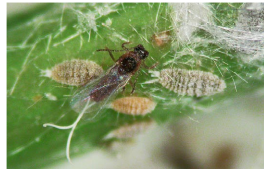
Figure 2. The adult male of Gill's mealybug (center) has one pair of wings and two long tails compared with the wingless immatures and adult females. Adult males are rarely noticed in the field.