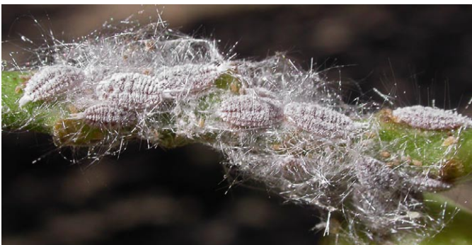
Figure 8. During the late spring, mealybugs prefer to feed on the pistachio rachis, after which they move to the hulls.