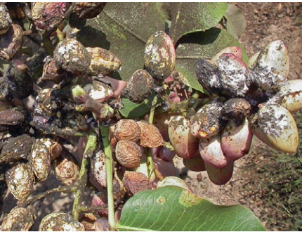
Figure 4. Pistachio clusters can become heavily contaminated with mealybugs, honeydew, and sooty mold.