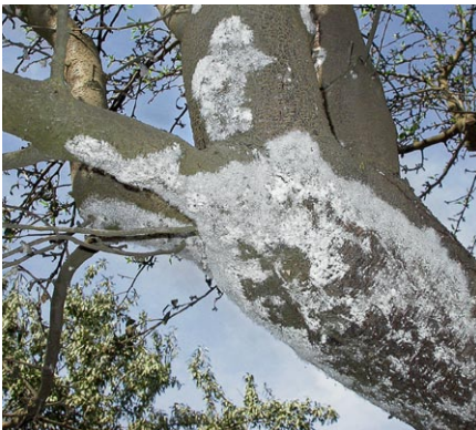
Figure 11. Aggregations of Gill's mealybug on the trunk of one of its alternate hosts, almond.

harvest. Whereas the overwintering generation has low survival rates throughout the winter, the two in-season generations are noted for their exponential growth rates such that one mealybug per cluster in May can result in hundreds of mealybugs per cluster at harvest.