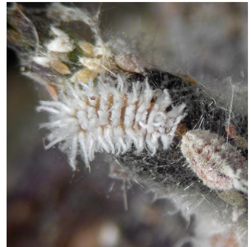
Figure 14. Predatory beetle larva (left) next to a mealybug.