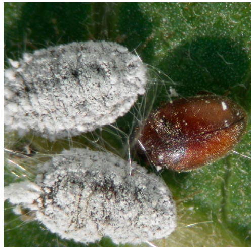
Figure 13. Adult predatory beetle (right) next to two female Gill's mealybugs.