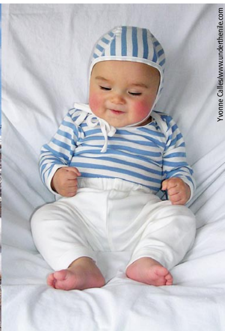
While organic crops must be transgene-free, cross-contamination of organic cotton by transgenic varieties is not expected to be a problem because seeds (which may contain genes from an engineered pollen parent) are removed from the lint (which is pure maternal tissue). Left , a cotton crop; right , baby clothes made with organic cotton.