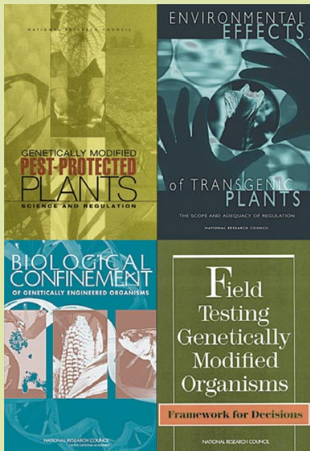
The National Research Council has published numerous science-based reports on the environmental risks and benefits of transgenic plants and food.

to deploy a pesticide through a plant that kills only a subset of insects than to spray one on a field that kills all insects willy-nilly?" The answer, of course, would be, "Yes, Bt in corn reduces environmental impacts relative to spraying broad-spectrum insecticides." However, prior to the advent of Bt corn, many American corn farmers did not spray insecticides to control the pests controlled with Bt (NRC 2000). Those farmers simply took their chances without any control, possibly because the damage from the lepidopteran pests of corn varies so much from one year to the next. In the latter comparison, the addition of Bt, if it carries adverse nontarget effects, does pose a new problem.