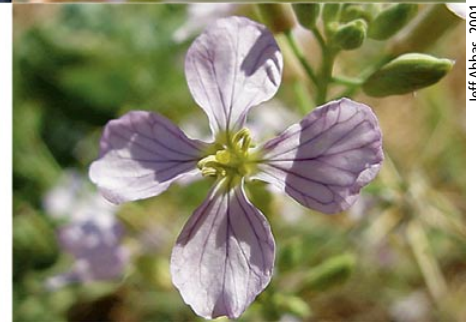
Jeff Abbas, 2001

Scientists are studying the implications of gene flow between cultivated crops and their wild relatives, a common phenomenon between plant species. For example, studies have considered, top left , cultivated wine grape ( Vitis vinifera ) and its wild relative, top right , California wild grape ( Vitis californica ), as well as, bottom left , crop radish and, bottom right , wild radish ( Raphanus sativus ).