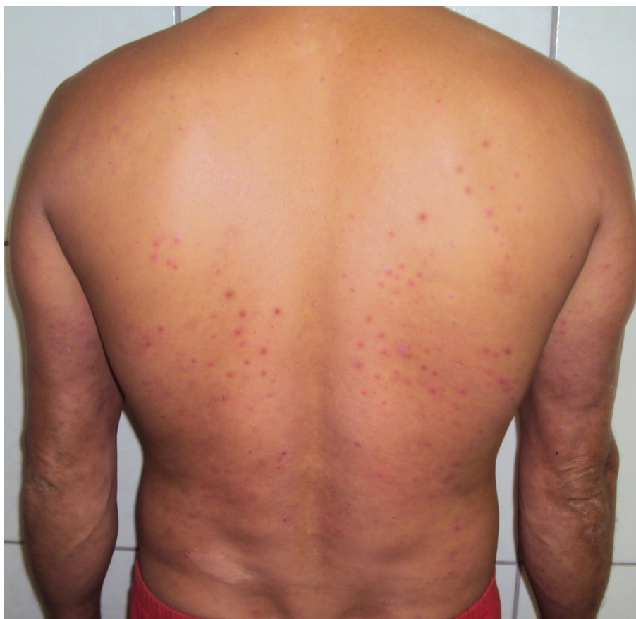
Figure 1. Clinical aspect of the lesion on the dorsum (erythematous papules and some pustules)

Based on the clinical findings and history presented by the patient, the hypotheses of acneiform eruption, bacterial folliculitis, and pityrosporum folliculitis were raised. To further investigate, biopsy of a lesion was performed.