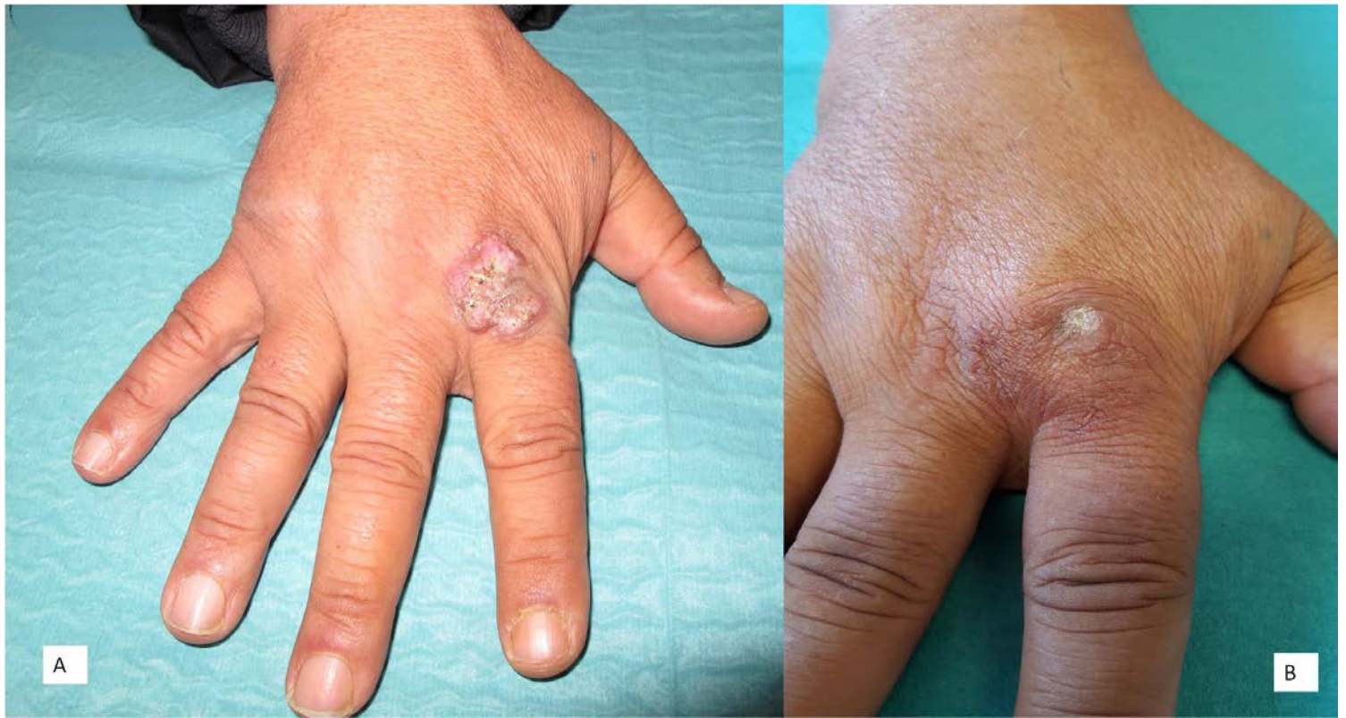
Figure 1. A. Hyperkeratotic tumor on dorsal aspect of the right hand B. Resolution after treatment

(Figure 2). Zielh Neelsen, Fite Faraco, and periodic acid-Schiff (PAS) staining and AFB smear were all negative. However, the culture showed the presence of non-pigmented mucoid colonies of alcohol resistant bacilli (ARB). Species identification based on 16S rRNA was consistent with Mycobacterium mucogenicum . After antimicrobial susceptibility testing, the patient was started on clarithromycin 500 mg, twice daily, in association with rifampicin 300 mg, twice daily, with resolution of symptoms in 3 months (Figure 1B). Voluntary and written consent was obtained for publication.