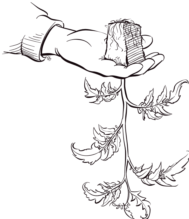
Figure 2. Avoid handling the stems or root ball of tomato transplants. Illustration by Will Suckow.

During planting, avoid damaging the roots. If the seeds were planted in biodegradable containers such as peat or paper pots, do not remove the containers, but break them up slightly so the roots can easily grow out into the surrounding soil. Be sure to bury peat or paper pots completely to avoid “wicking” of water away from the root zone. If plastic or other nonbiodegradable containers were used, ease the plants out of the pots before transplanting and gently loosen the roots somewhat. Avoid bruising the main stems of transplants—try to handle them by the leaves or root ball (fig. 2). Press soil firmly around each transplant so that a slight depression is formed for holding water, then water in thoroughly to settle the soil and eliminate any air pockets around the roots.