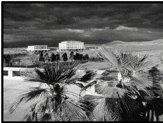
The new campuses at Irvine (left) and Santa Cruz opened to students in 1965 amid a building frenzy and projections of large scale enrollment growth. Here the two campuses are shown in 1968 with temporary trailers (background) shown on the Santa Cruz campus.