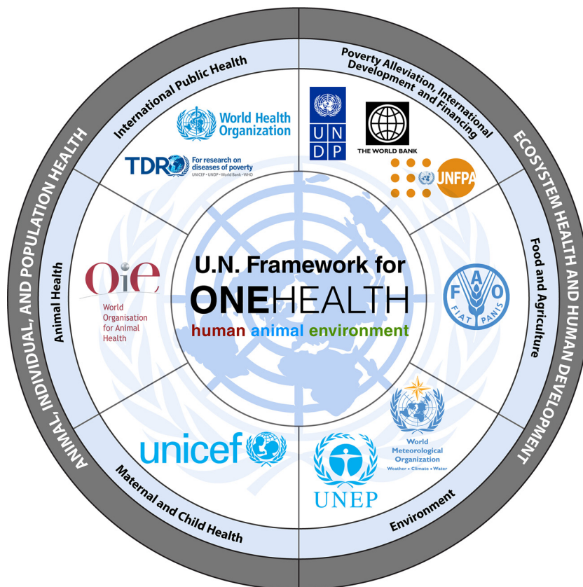
FIG 3 Proposed United Nations “One Health” framework. FAO, Food and Agriculture Organization; OIE, World Organization for Animal Health; TDR, WHO Special Programme for Research and Training in Tropical Diseases; UNDP, United Nations Development Programme; UNEP, United Nations Environment Programme; UNFPA, United Nations Population Fund; UNICEF, United Nations Children’s Fund; WHO, World Health Organization; WMO, World Meteorological Organization.

canine-related zoonoses, and the importance of One Health and the globalized food supply chain (201, 272, 339–341).