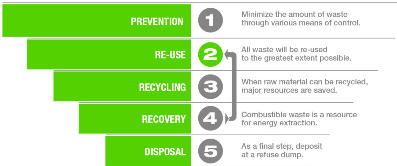
Figure 2. The waste management hierarchy of the EU, which is also endorsed by the EPA.