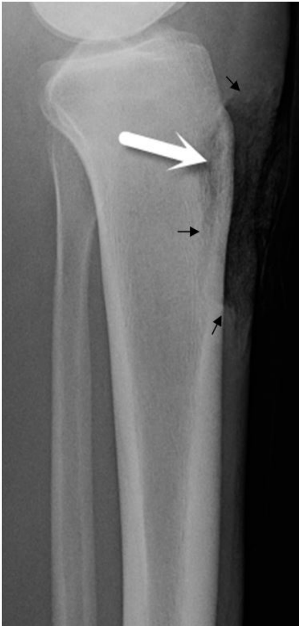
Image 1. Lateral plain radiography demonstrating a soft tissue defect (black arrows) along the proximal anterior tibia with subtle cortical demineralization (white arrow).

Six weeks later, the patient returned to our ED with increased pain and malodorous serosanguinous drainage from a non-healing 7×5 cm wound involving his left medial shin. Plain radiography demonstrated underlying demineralization of the anterior tibial cortex (Image 1). Operative debridement confirmed necrotic bone and periosteum. Tissue cultures grew Escherichia coli ,