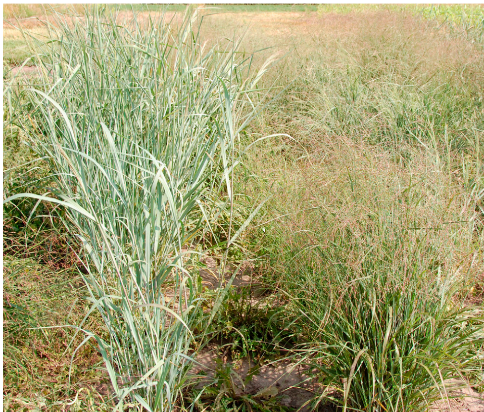
Figure 2. Photograph of lowland switchgrass (left) and upland switchgrass (right) taken in late August near Arlington, WI.

and cytogenetic studies especially for generation of inbred lines and to assist genome-sequencing effort but all individuals have so far been completely male and female sterile (Young et al., 2010; D.L. Price and M.D. Casler, personal communication, 2011).