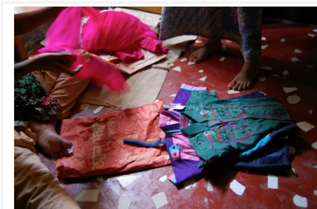
Children's clothes purchased for Eid ul Fitr are displayed; social pressures make Ramadan and Eid periods of financial insecurity (2014).

In my first post, I introduced my IMTFI-funded research into the Islami Bank Bangladesh Limited (IBBL) and its Islamic microfinance program for the rural poor, the Rural Development Scheme (RDS). I explored the slippages between institutional (here the IBBL) versus client understandings of the 'Islam' of Islamic microfinance. In this posting, I continue the discussion by addressing how a financial institution might not know its client because it does not fully grasp the assumptions and possibilities contained in clients' financial vocabularies and their accounting and calculation practices in space and time.