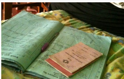
A client passbook and bank ledger, detailing RDS accounts (2013)

Sums and counting are performed verbally and often collectively, and the cardinal and ordinal numbering of time frames (whether weeks, months, or years) are situated against other measurements of the passage of time. These include the six Bengali seasons; events on the Islamic calendar, namely, Eid ul Fitr, Eid ul Adha, Shab-e-Barat, and Ramadan; and events such as a hospital stay, marriage, or child's birth.