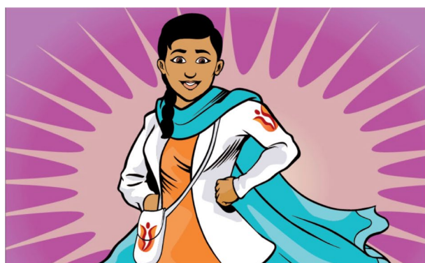
Super Divya introduction

engagement in using simulations in healthcare facilities (Fig. 1). To improve medical education, the use and effectiveness of comics has been well documented in the literature. Maternal and child health comics were cited as an important and most commonly read topic in comic form among medical students in a study in India [21]. Additionally, comics assist with engaging learners, inspiring empathy, and with critical thinking