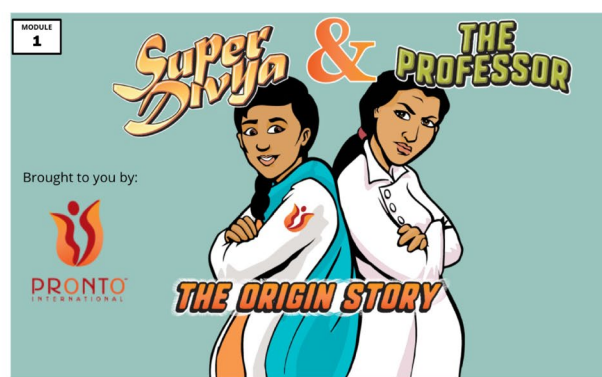
Super Divya and Professor Agni