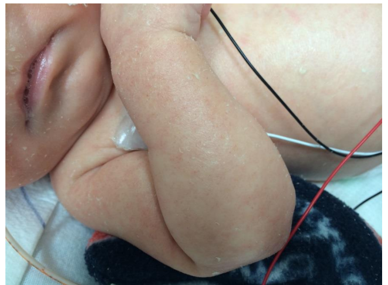
Figure 1. Atypical complete DiGeorge syndrome. Dysmorphic facial features include narrow palpebral fissures and a depressed nasal bridge Diffusely scattered erythematous small papules over an erythematous background and fine scale on face, trunk, and extremities.

Laboratory evaluation at admission revealed hypocalcemia with mild increase in serum phosphate levels, as well as eosinophilia (WBC = 5.6 and 13 % eosinophils) and elevated IgE at 329 IU/L (normal < 160 IU/L). Serological screening for human immunodeficiency virus, Epstein-Barr virus, and cytomegalovirus were negative. The patient had a normal 46 XY karyotype, and no deletion in the 22q11.2 region was noted on fluorescence in situ hybridization (FISH).