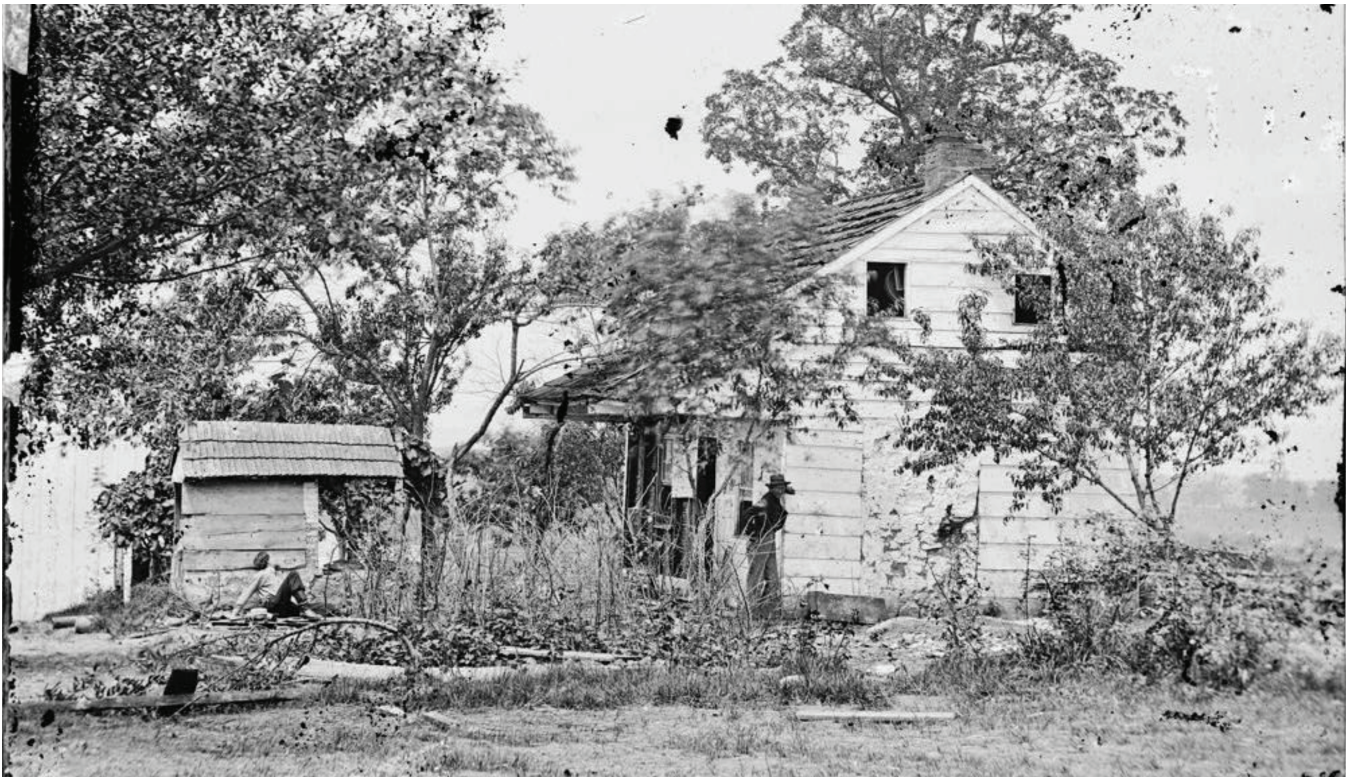
The Abraham Brian farmhouse in mid-July 1863, photographed by Mathew Brady.

how Civil War battles extended far beyond the “field” of combat, and how the so-called rules of war that protected civilians were more often ignored than followed.