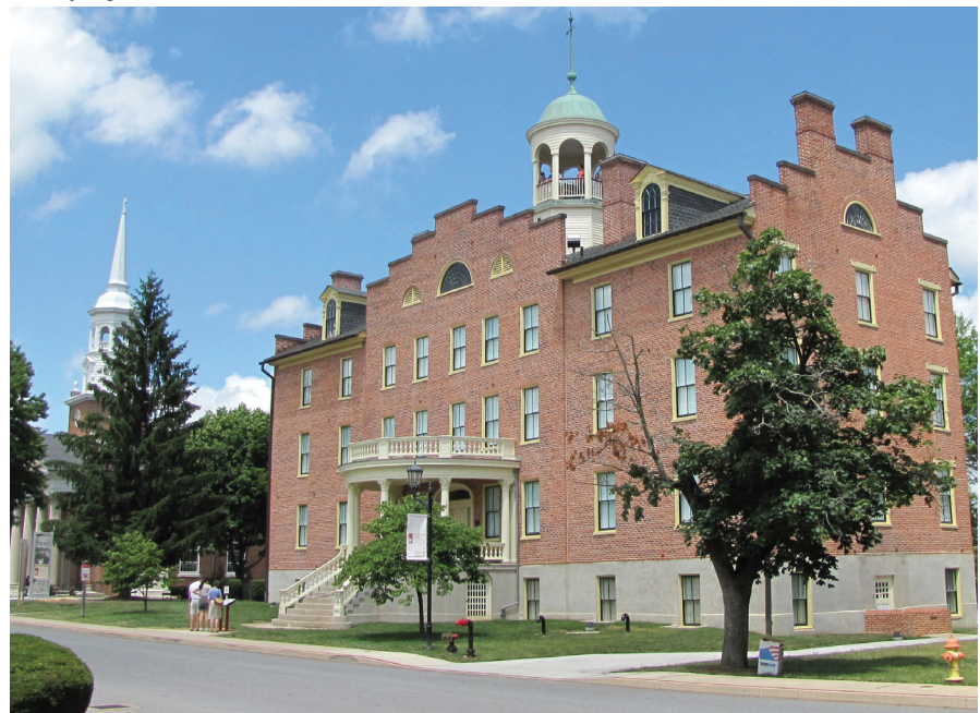
Seminary Ridge Museum and Education Center

Almost next door on Seminary Ridge, under the historic cupola of the Lutheran Seminary, and at the site of critical action on July 1, 1863, stands the Seminary Ridge Museum and Education Center. One of the first of the "new" museums to explore the broader dimensions of the battle (it opened in 2013), this non-profit foundation introduces visitors to such topics as 19th-century religious debates and Civil War era medicine. It offers walking tours and an escape room where visitors can re-enact operations of a Union signal corps. Its robust educational component also invites visitors to engage with the history of race and slavery. In a virtual education segment called "Going to War," for instance, viewers are asked to think about what