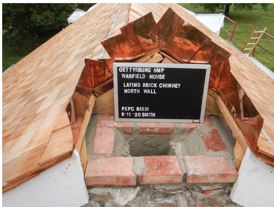
Detail of the restoration of the James Warfield home.

Indeed, I wondered what had changed along Confederate Avenue, that stretch of asphalted roadway