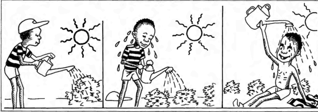
Figure 1: A simple sequence of images used in cross-cultural research in Botswana, from Byram and Garforth (1980).

Despite these narrative and causal relations, at the most simple level, understanding of sequential images requires only two basic constraints (Bornens, 1990; Cohn, In prep). First, a comprehender needs to understand that the characters and elements found in one image are the same referential entities as those in prior and subsequent images. This is the continuity constraint . In Figure 1, this constraint guides our recognition that the character in the first frame is the same as the character in the second and third frames. Without adhering to the continuity constraint, we might interpret each frame as depicting a different scene and thus a different character. In this case, Figure 1 would not show one boy three times, but would show three separate boys.