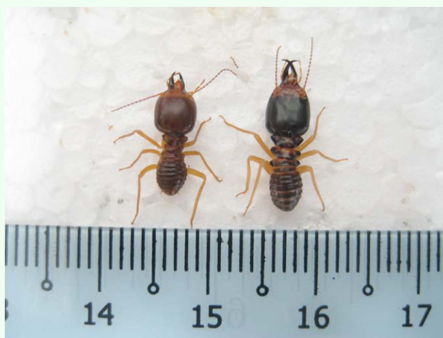
Figure 1. Macrotermes carbonarius soldier. Left: parasitized soldier; Right: healthy soldier, (Scale bar = 1.0 mm). High quality figures are available online.