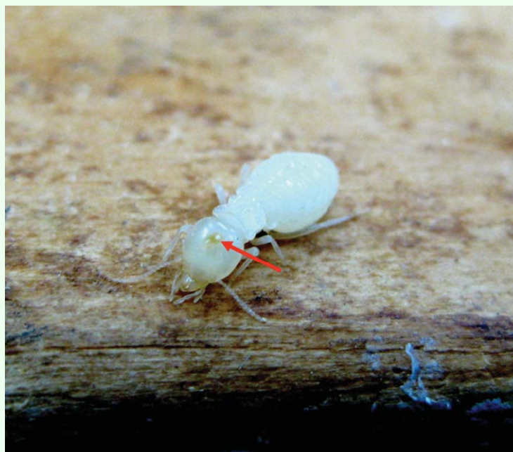
Figure 4. Parasitized Macrotermes carbonarius presoldier. A tiny dot (mouth hook of a larval parasitoid) can be seen inside the head capsule of the pre-soldier. High quality figures are available online.

were parasitized. However, none of the mature workers or L3 and L4 stages was parasitized.