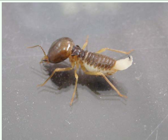
Figure 2. Larval parasitoid emergence posture in a parasitized soldier. High quality figures are available online.

days to develop to the adult stage under laboratory conditions. The fly was identified as V. fasciventris by Dr. H. Kurahashi (International Department of Dipterology, Tokyo, Japan).