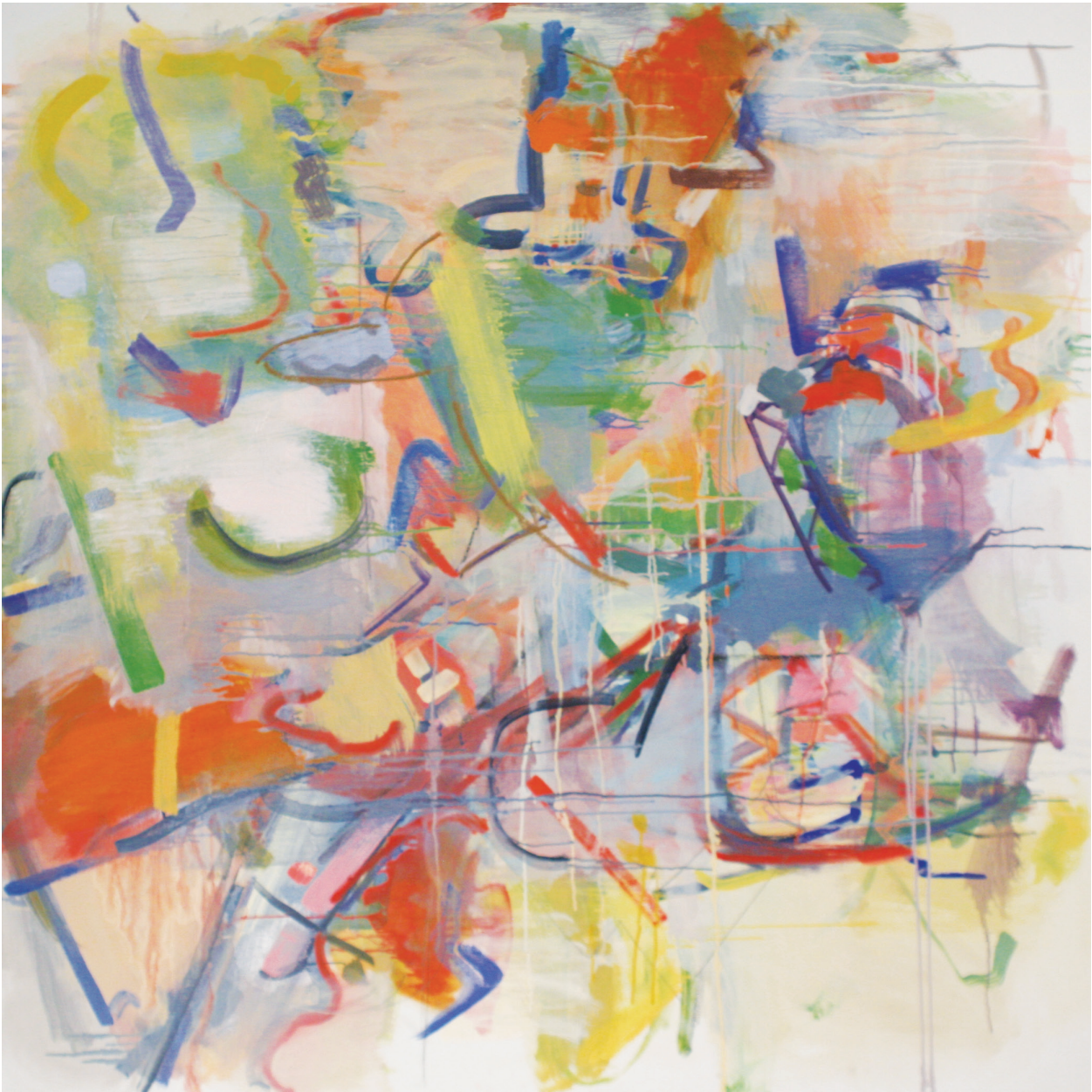
Drawbridge , 2009-2010, oil on canvas, 48" x 48"