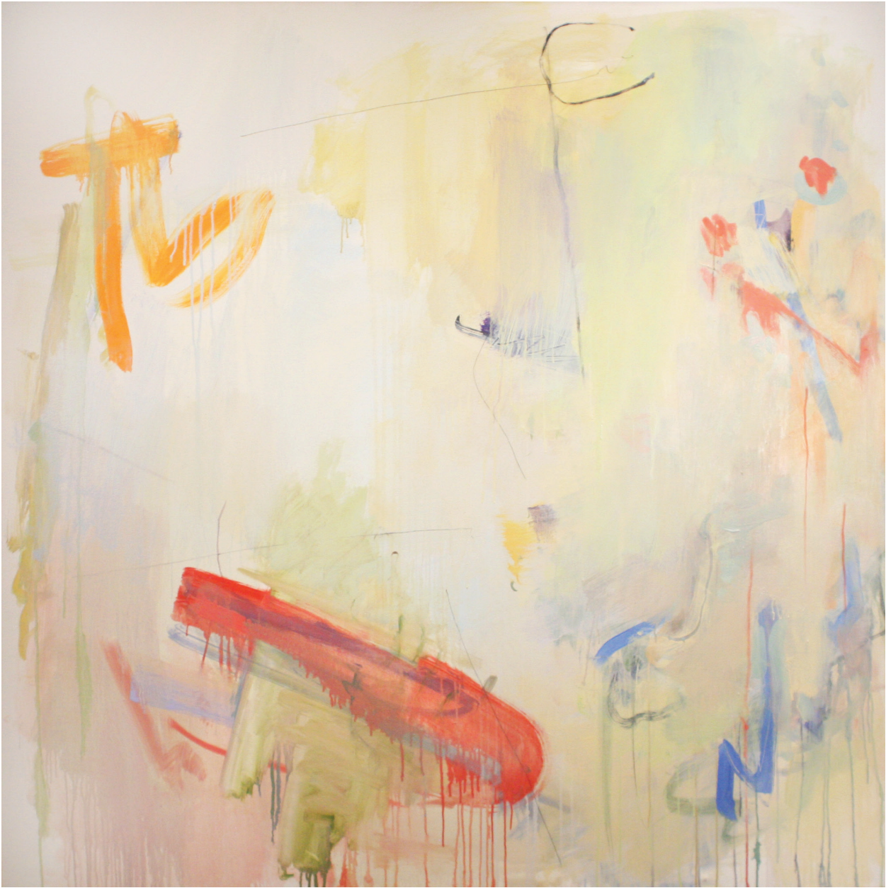
Interlude , 2009, oil on canvas, 48" x 48"