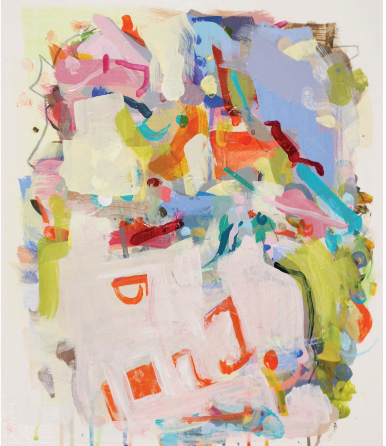
Orange Windows, 2010, acrylic on paper, 20" x 16"