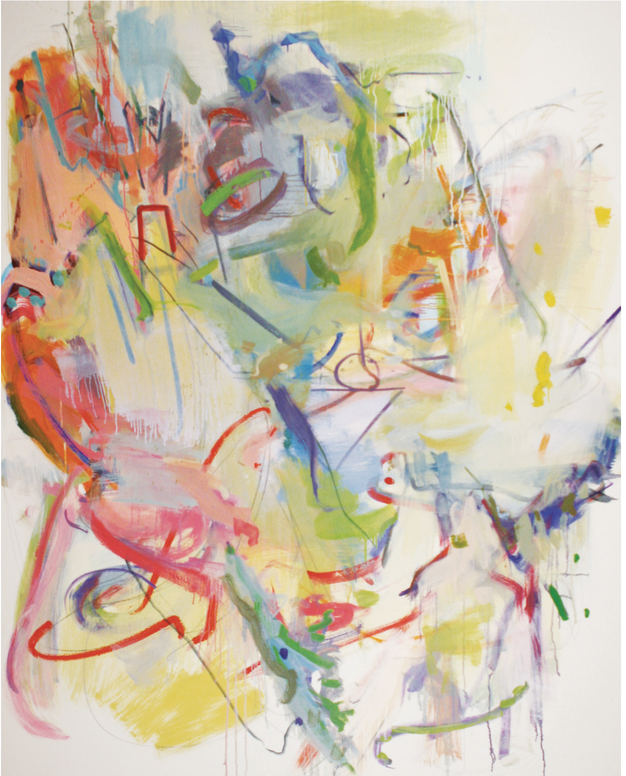
Restraint , 2010, oil on canvas, 60" x 48"