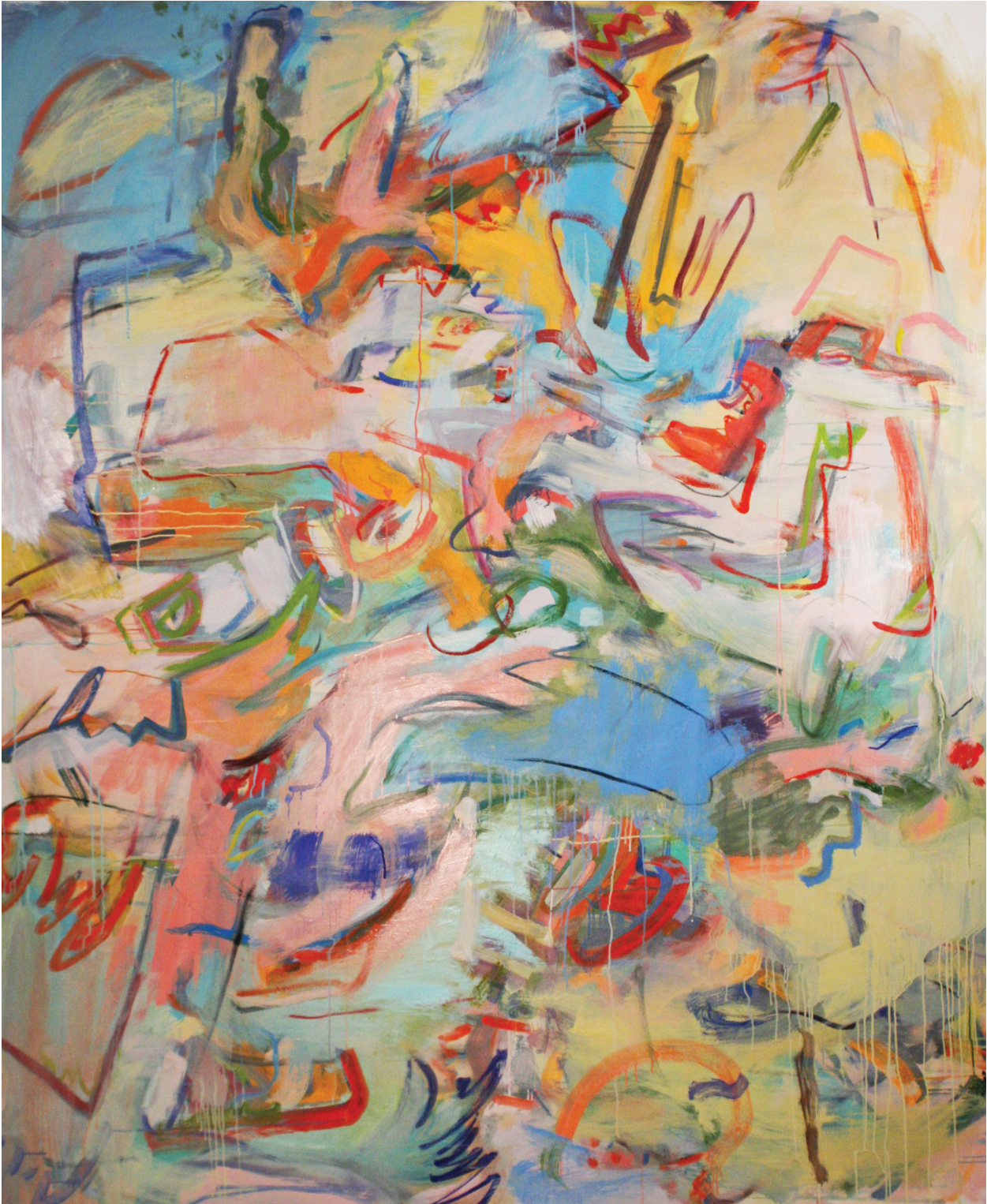
Fast Forward , 2009, oil on canvas, 72" x 60"