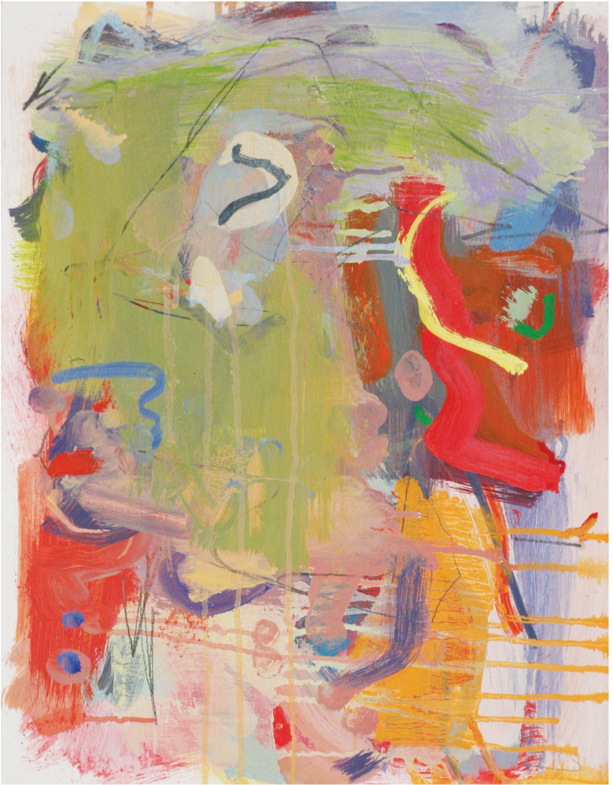
Underwater , 2010, oil on paper, 14" x 11"