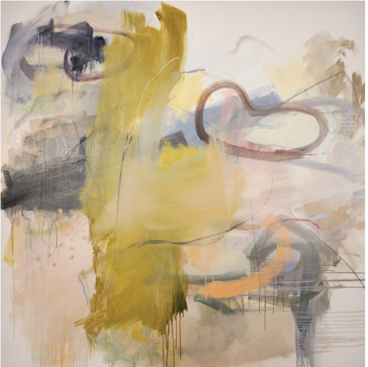
Encounter , 2009, oil on canvas, 48" x 48"