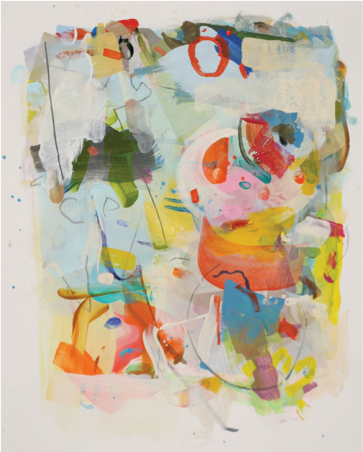
Suspended Circle , 2010, acrylic on paper, 14" x 11"