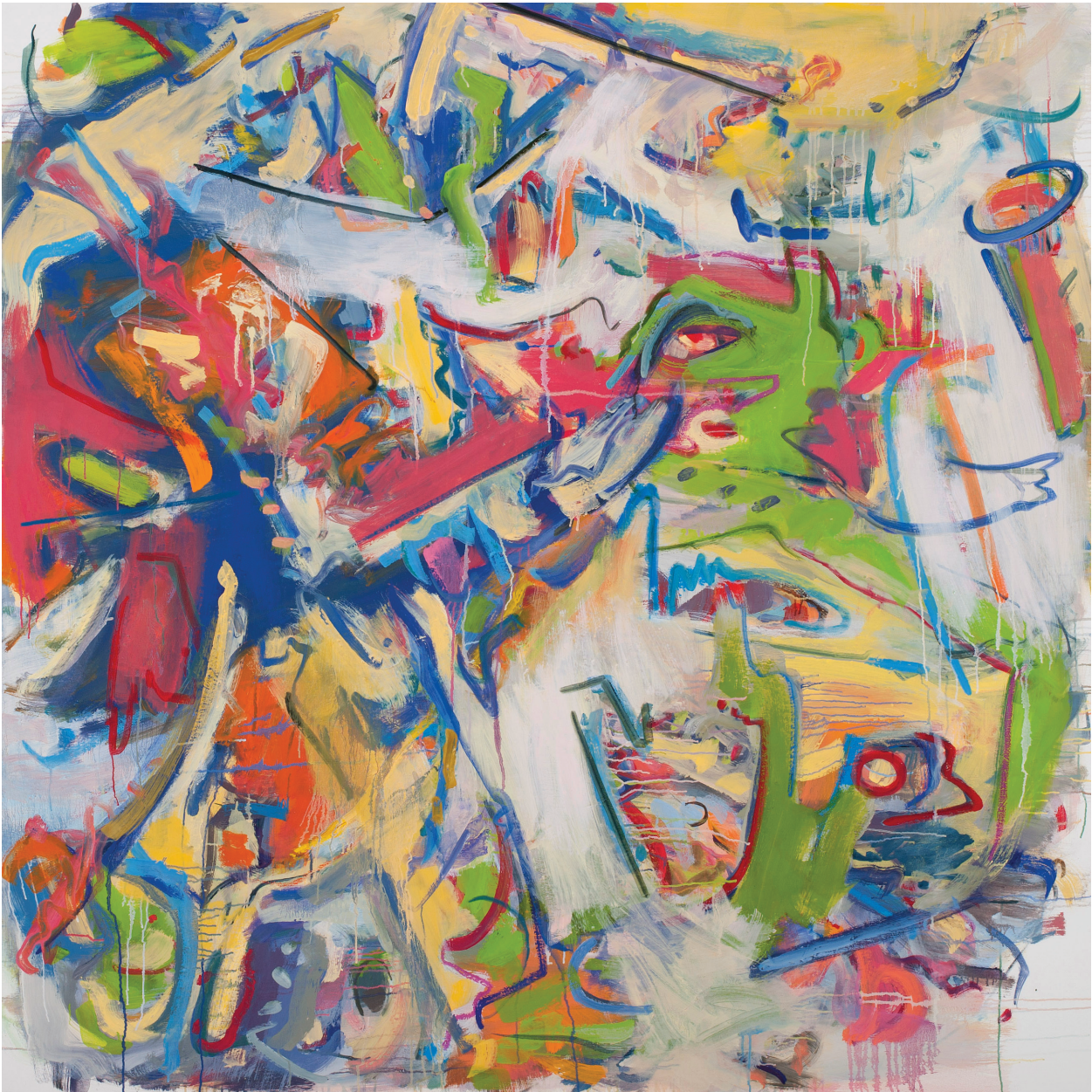
Collision , 2010, oil on canvas, 60" x 60"