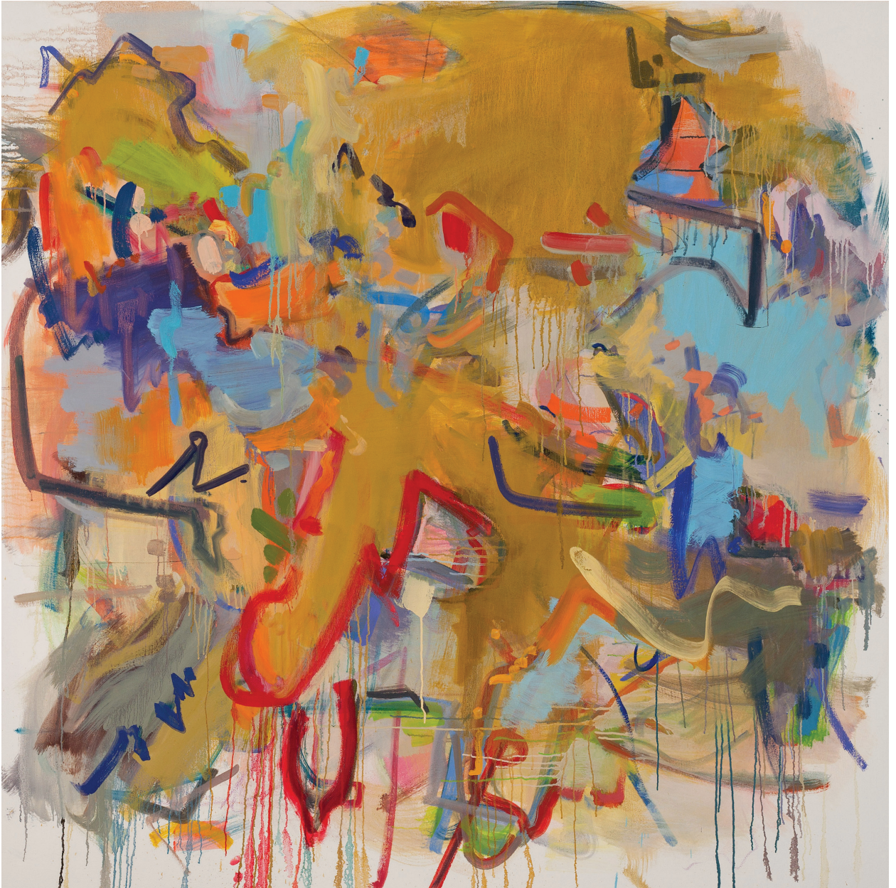
Lances , 2010, oil on canvas, 60" x 60"