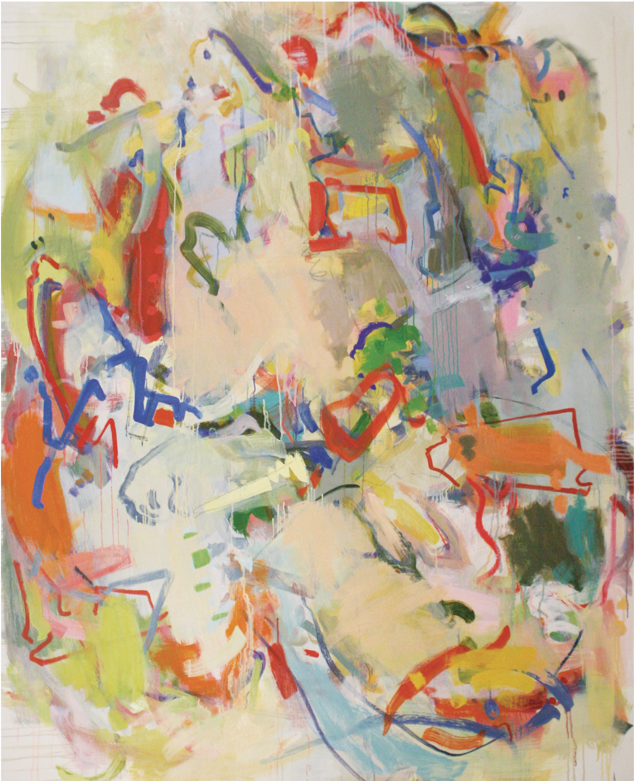
Deruta , 2010, oil on canvas, 60" x 48"