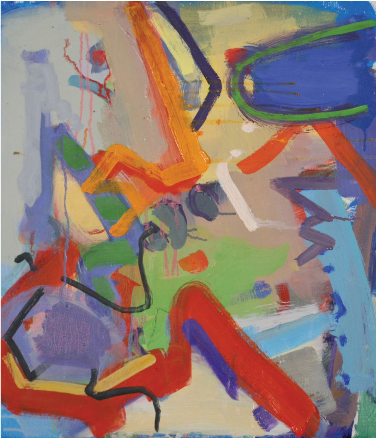
Stretching Out , 2010, oil on canvas, 20" x 16"