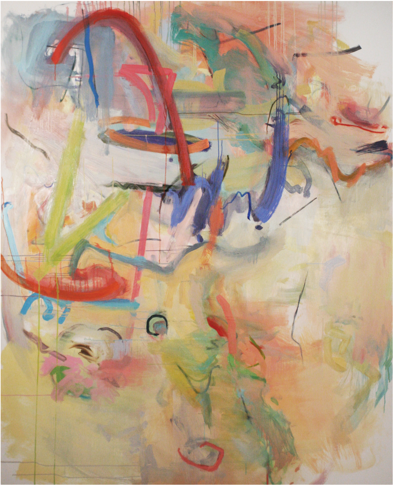
Saddle , 2009, oil on canvas, 60" 48"