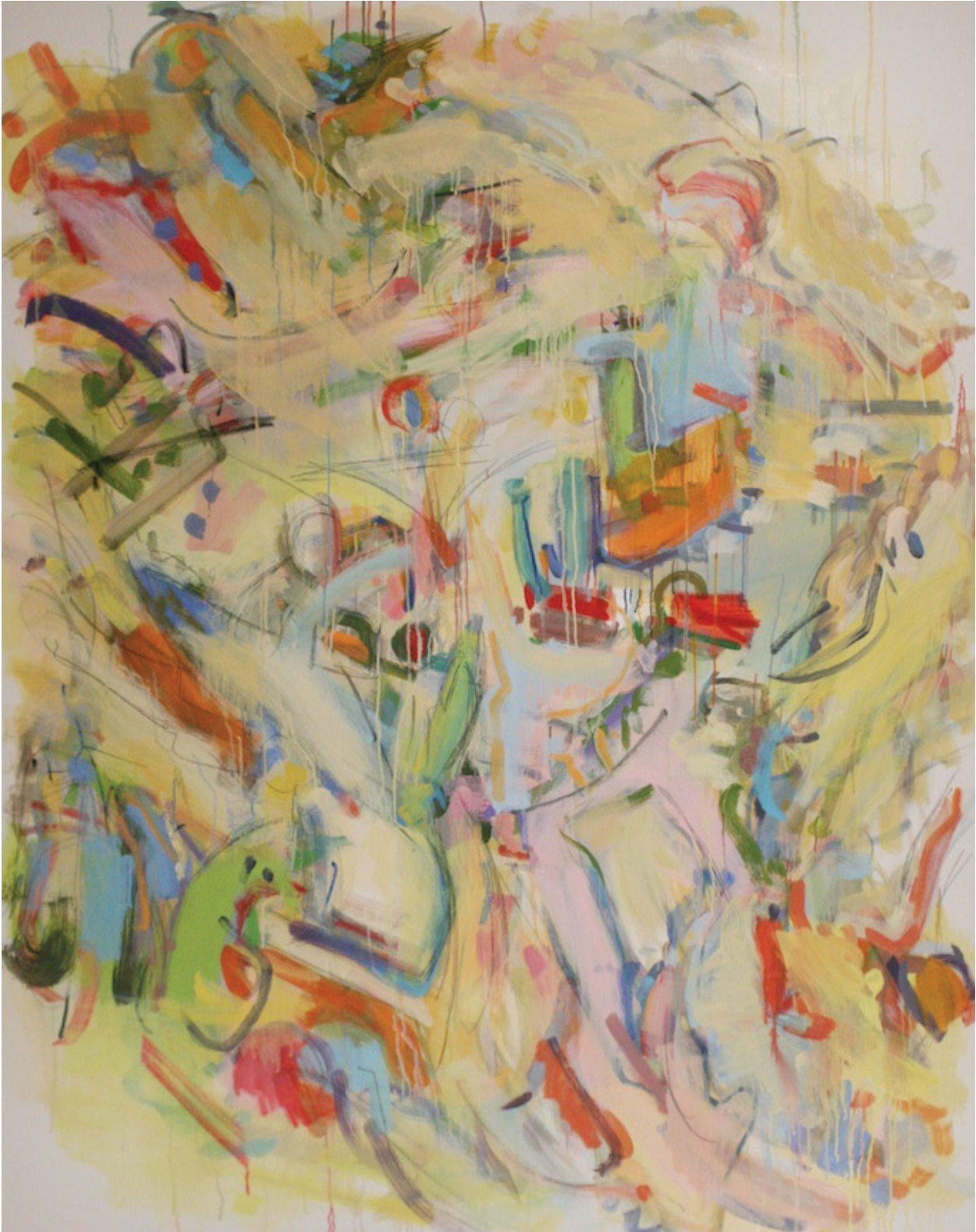
Corciano, 2010, oil on canvas, 60" x 48"