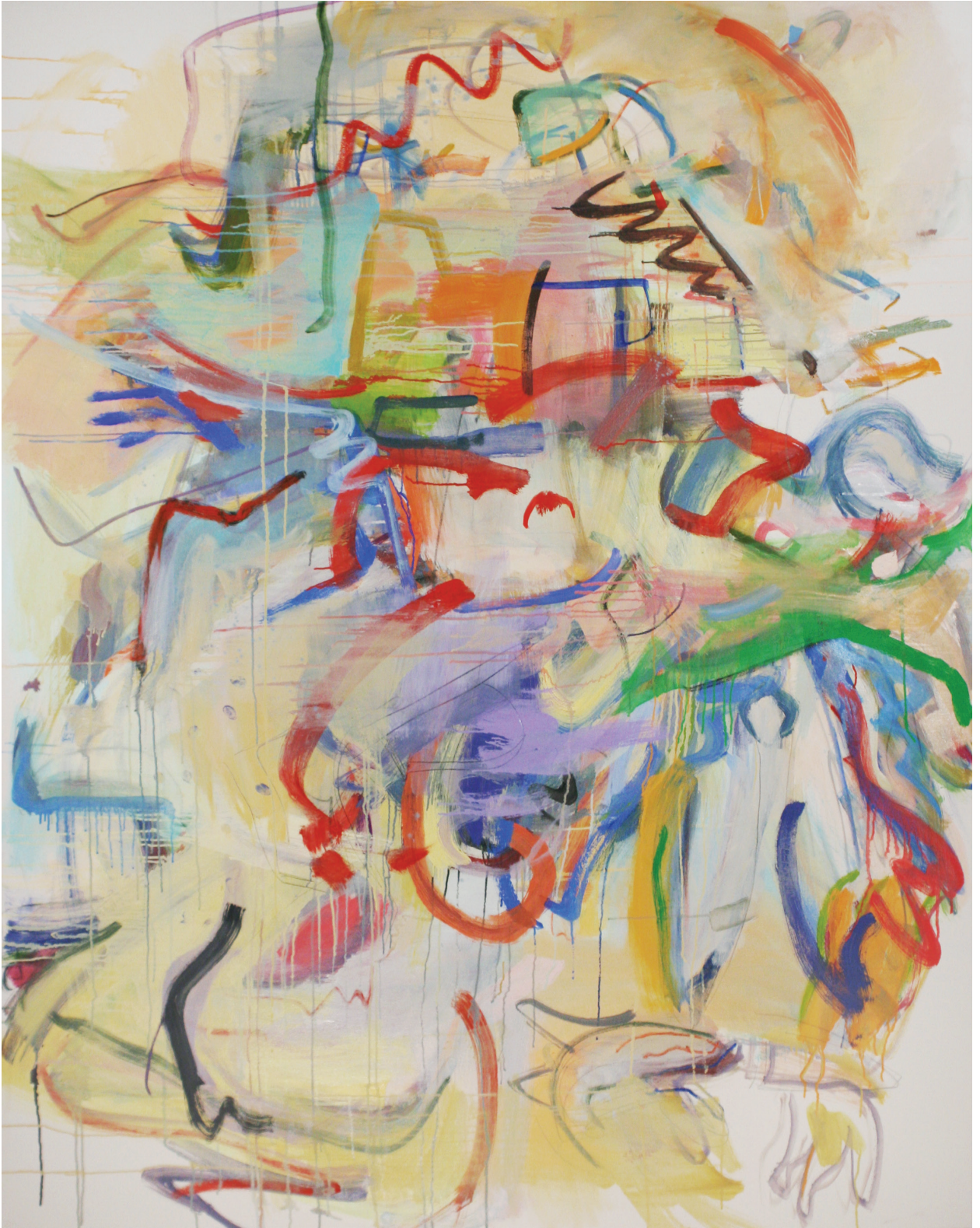
Headdress , 2009, oil on canvas, 60" x 48"