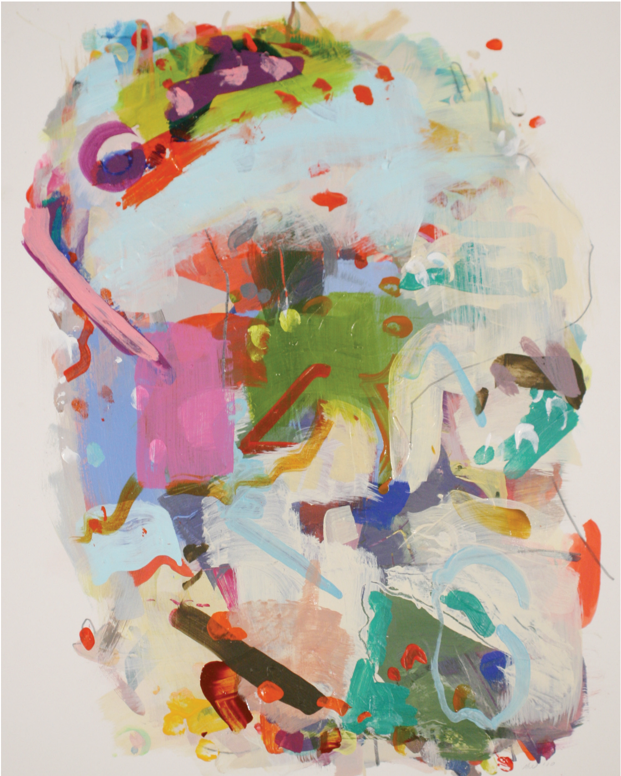
Scattershot, 2010, acrylic on paper, 20" x 16"