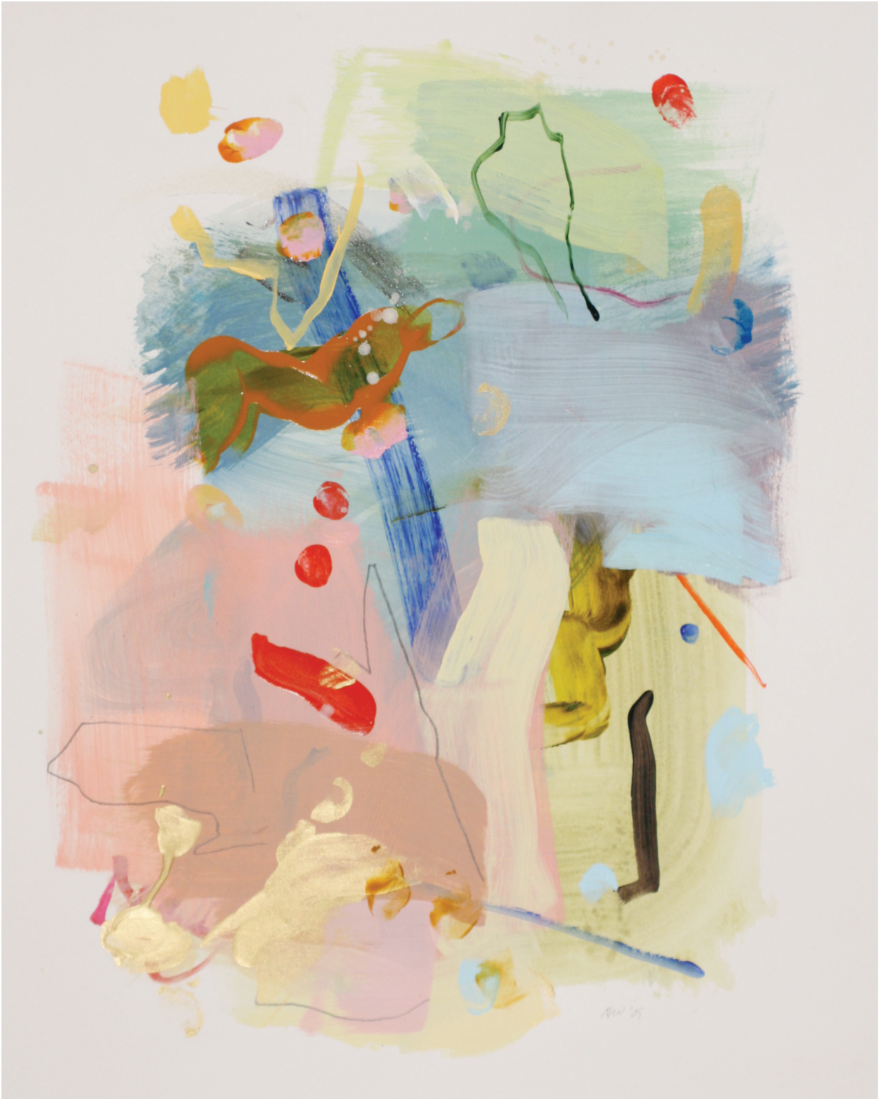
Blue Veil, 2010, acrylic on paper, 20" x 16"