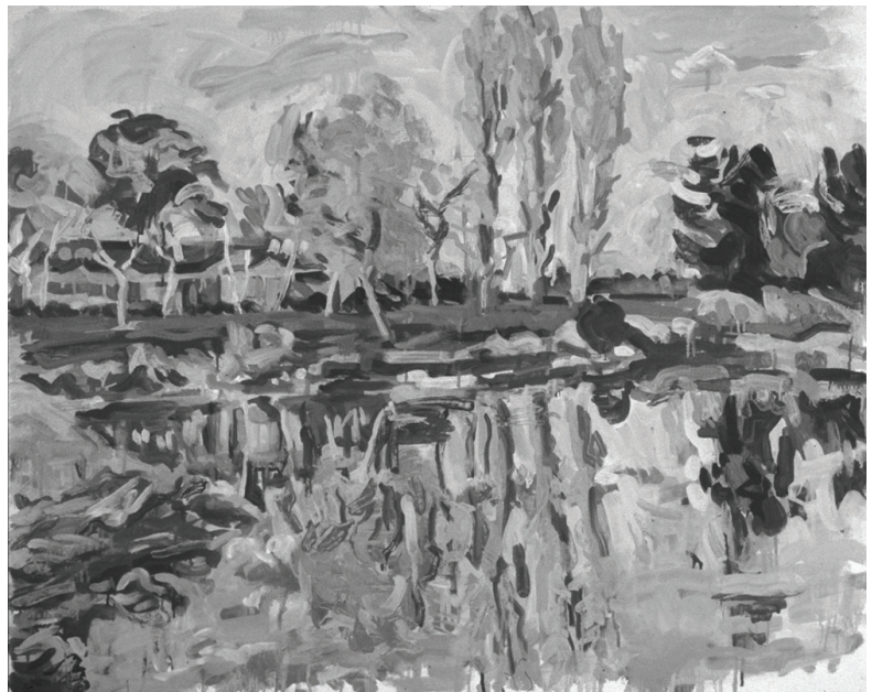
Davis Pond - Fall, 2005, oil on linen, 30" x 40", private collection