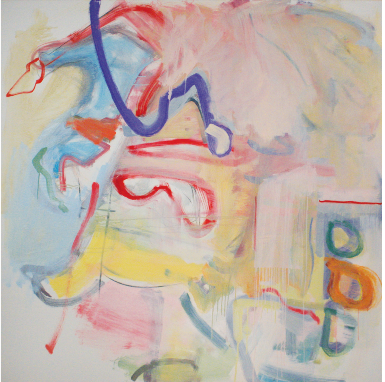
Cloak , 2009, oil on canvas, 48" x 48"