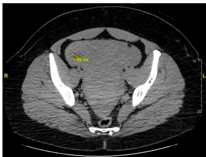
Image 2. Computed tomography of the pelvis showing a 1.69-centimeter area of low attenuation in the right adnexa. cm, centimeter.