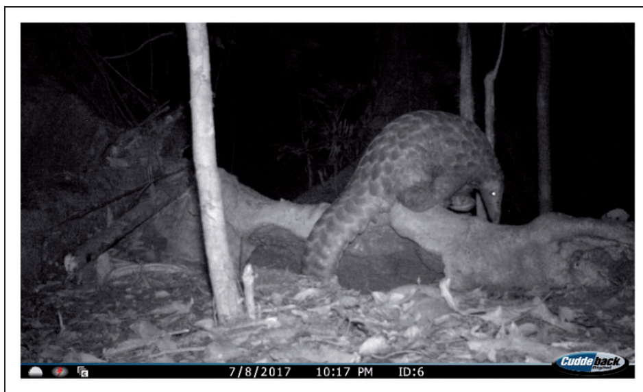
Figure 2. Giant pangolin photographed by camera trap leaving a burrow at Bouamir Research Station in the Dja Biosphere Reserve, Cameroon.

One camera trap out of nine at eight localities (two burrow entrances were associated with a single tree) photographed a pangolin at a burrow in this survey (Figure 2). The burrow was adjacent to a tree located on a northeast facing slope at the edge of a swamp. The tree had multiple burrow entrances around its trunk and roots, and cameras were placed to capture