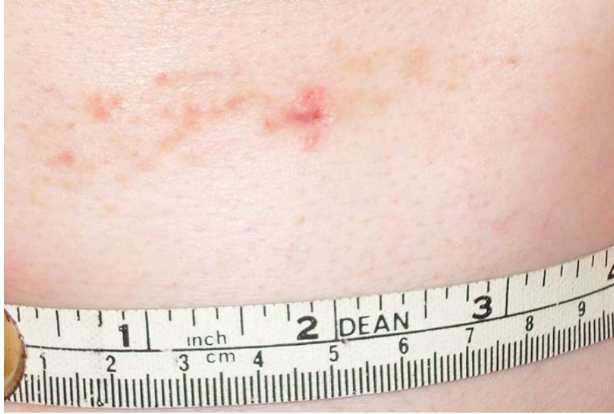
Figure 1. Red-to-brown papules in a linear distribution on the left lateral chest

biopsy of a single papule revealed foci of suprabasilar, acantholytic clefting and overlying areas of parakeratotic keratinocytes within a hyperkeratotic stratum corneum (Figure 2). Corp ronds and corp grains were noted (Figure 3). The patient was diagnosed with type 1 segmental Darier disease and treated with tretinoin 0.025% cream nightly, which in combination with avoidance of triggers, resulted in decreased pruritus.