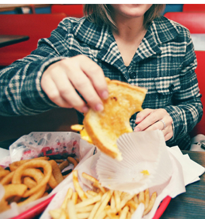
Living in an unhealthy food environment has been linked to unhealthy eating behaviors.

The prevalence of overweight and obesity among fifth, seventh-, and ninth-grade children in 2010 varied widely from county to county (Exhibit 1). Of the 58 counties in California, the prevalence of overweight and obesity was greater than 43 percent in ten counties. Among those, the highest rates were in Del Norte (45%), Colusa (46%), and Imperial (47%) counties. Only nine counties in California had rates of overweight and obesity below 30 percent. The