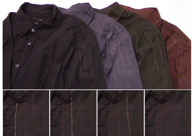
Figure 2. (top) Ripple, a shirt whose three shoulder pinstripes change color in response to skin conductance, was produced in multiple colors and sizes. (bottom, from left to right) Pinstripes fade to white one by one, then all return to gray.

So, we designed Ripple to seem unauthoritative and invite critical questioning, and build on prior work. We previously studied social interpretation of thermochromic t-shirt skin conductance displays during 45-minute conversations in an office. We found the display was enrolled in self-presentation and that it might be desirable to enact social performances with biosensing displays [36]. Ripple’s design supports social performances and expands both the length and contexts of the study to form a richer picture of biosensing in participants’ daily lives. The always present yet unobtrusive display was available to participants as they experienced a range of situations and social circumstances,