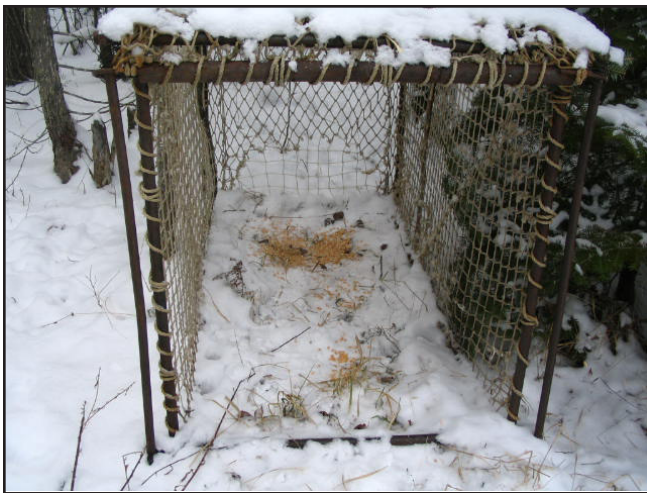
Figure 3. Baited Clover trap.

in high fenced areas, and storing supplemental feed in a closed barn. One study site has been previously infected with bTB, and 3 of the study sites are in close proximity to infected or previously infected farms.