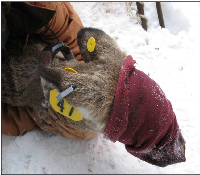
Figure 6. Deer with blindfold, ear tags, and radio collar.

and cattle. Spatial analysis on deer locations relative to livestock management practices and farm structures will take place when all data is retrieved in late 2008 and early 2009. Once complete, we hope this information will allow us to recommend mitigating measures for livestock producers to reduce the risk of transmission of bTB from free ranging white-tailed deer to domestic cattle.