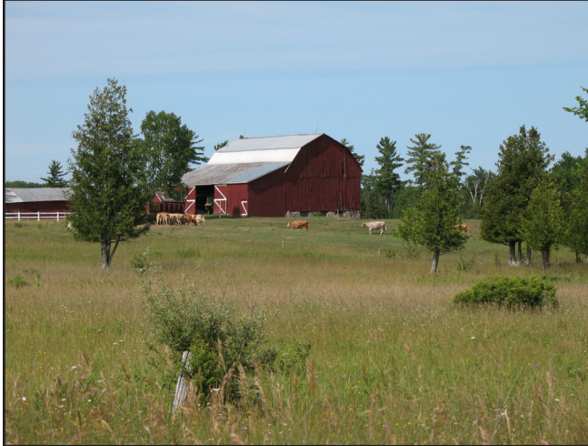
Figure 2. Example of a study site.

Study sites are beef cattle farms ranging from 30-160 ha in and around DMU 452. Each farm manages \geq 20 cattle annually and includes wooded areas that serve as cover and winter deer habitat (Figure 2). All farms use similar feeding and management practices, including pasturing cattle during the summer, storing hay bales