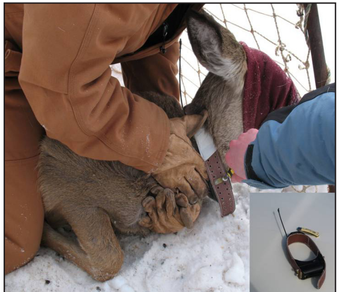
Figure 5. Attaching a GPS collar.

fitted with uniquely colored and numbered ear tags and a radio collar equipped with a global positioning system (GPS) (Figures 5 and 6) (Advanced Telemetry Systems, Inc., Isanti, MN). Each GPS collar is programmed to record a location every 2 hours for 1 year after activation before dropping off. Deer are tracked bi-weekly using VHF telemetry to monitor for mortalities and determine whether deer are remaining on or near study sites.