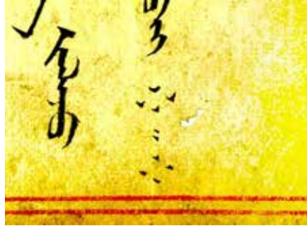
Figure 6. A quadripartite marker of the end of a theme (see also figure 7, in which the marker appears at the bottom of the folio).

another quadripartite dot below to mark the end of a theme or a chapter (figure 6). According to Kara's study of Mongolian and Buryat manuscripts, these two shapes of the mark denoting the end of a theme and a chapter first appear in nineteenth-century manuscripts written by the Khalkhas and Buryats. This is yet another indicator that the manuscript was produced sometime in the late nineteenth or the early twentieth century.