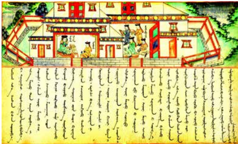
Figure 8 (folio 3). Queen Molun seated on a low cushion, exchanging words with Labay prior to his departure from home.

In the subsequent ten illustrations, we see the traditional Mongolian utensils of daily life, such as a milk container, cups for drinking milk tea, and implements used for daily worship. Transforming the characters of the tale into representatives of Mongolian people, and depicting traditional Mongolian household items, the illustrations render the tale more relevant to a Mongolian audience. By observing the likeness of the illustrations to their own lives, Mongolian viewers do not need to imagine a connection with the story; they can directly experience it. Illustratively clothed in the Mongolian system of representation in this way, the Molon Toyin's tale became a product of acculturation, not merely through linguistic signs but also through its pictorial interpretations and adaptations. By means of indigenous Mongolian signifiers, the illustrator succeeds in translating the popular Buddhist tale into local folklore, demonstrating the well-known fact that an image is never a neutral medium of transmission (figure 8).