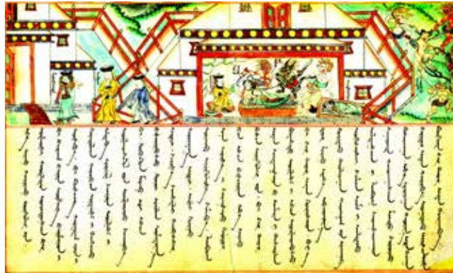
Figure 12 (folio 11). Scenes from Queen Molun's suffering in hell after her death.

In figure 12 (folio 11), we see Queen Molun lying sick on her bed and vomiting blood. The messengers of Yama, the Lord of Death, are pulling her with their chains and hooks. Next to this image, in the same folio, the illustrator gives us hints of her approaching fate by depicting her lying dead and blindfolded in a coffin and then naked, bleeding from her genitals and other bodily parts, as creatures of hell stab her with various implements (figure 12).