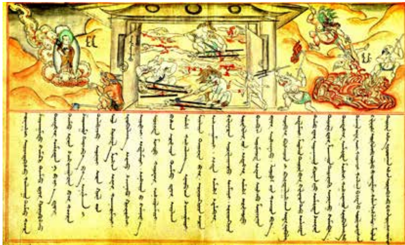
Figure 18 (folio 22). Scenes from the Hell of Blood, Hell with Black Rulers, and Molon Toyin asking the guardian of hell about his mother.

In figure 19 belonging to a different manuscript with the exact same narrative, we see a more crudely executed illustration. Those born in the Hell of Blood are also depicted in the far right corner of the folio, swim in their individual pools of blood but are not tortured with tridents. Their facial expressions appear calm in comparison to those in figure 18. To the left of the Hell of Blood is one of the cold hells. Perhaps due to the illustrator's lack of artistic talent, the suffering beings in this cold hell appear to be smiling. In the upper left corner, Molon Toyin stands on a cloud that covers the lower part of his body, with his palms raised.