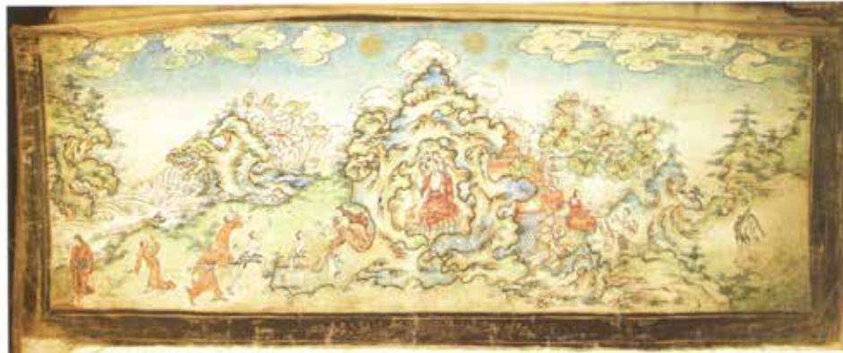
Figure 1. A page from the Biography of Nāgārjuna (fifty-one folios, 13.5 x 1.4 inches), mineral pigments and gold on cotton, 18th century. Because this picture album is devoid of any text and very little is known about Nāgārjuna's life, it is difficult to ascertain why Nāgārjuna, depicted in the left corner of the painting, is observing the birds and butterflies in the field of flowers.

This article focuses on narrative illustrations, which have come to us in two different forms: with an accompanying written text or without any text. Those without a text are pictorial narratives, or picture books, whose common themes are biographies of famous Buddhist figures and popular Buddhist tales. One such book is the eighteenth-century illustrated Biography of Nāgārjuna currently held in a special collection of the Mongolian National Library in Ulaanbaatar (figure 1).