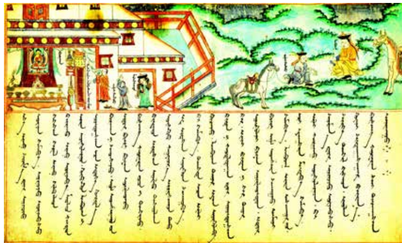
Figure 11 (folio 8). Queen Molun restoring the shrine and pretending to worship the Buddha upon hearing of Labay's return home from his brother.