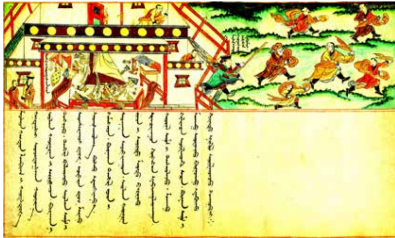
Figure 10 (folio 6). Queen Molun chasing the monks away.

The signs of Queen Molun's corruption detectible in this tale are further illustrated in the three folios (9–11) in which we see her chasing away monks with a stick in her hand and the family's table altar in a state of complete disarray (figure 10); her pretense to be a virtuous woman at Molon Toyin's brother II's arrival and for Molon Toyin's return home is suggested by the image of monks refurbishing the family shrine. The illustrator adds many such details not mentioned in the text, depicting her sitting again on a low cushion in front of the modest table with nothing more than a bowl of milk tea (figure 11).