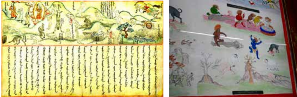
Figure 15 (folio 19) (left). Suffering of beings in a Stabbing Hell, witnessed by Molon Toyin.

stabbed by knife, cut by axe, crushed by vehicle, or run over by horse or committed suicide (figure 15).