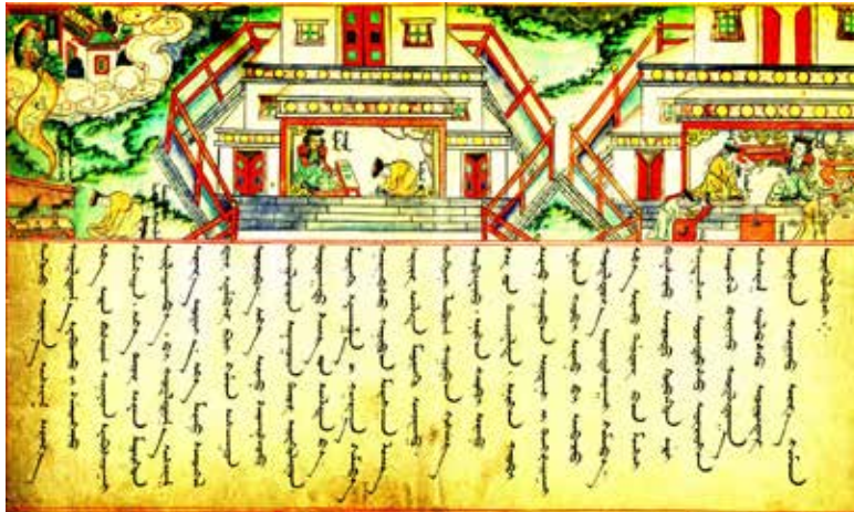
Figure 2. Folio page with two registers per frame.

manuscripts that consist of folios with two registers per frame (such as figure 2 taken from the manuscript of the Molon Toyin's tale discussed below). In some other manuscripts of the Molon Toyin's tale, like in the one presented in figures 3 and 4, illustrations are presented in separate folios from those containing the written text. This presentation suggests that the illustrator, who was most likely also a scribe, or worked in collaboration with a scribe, directly controlled the organization of the manuscript and the presentation of the text and images. Furthermore, as seen in figure 2 (a folio page taken from the Ulaanbaatar illustrated manuscript) and figure 3 (a folio page taken from a different manuscript), the representation of Queen Molun's palace bears the characteristics of Sino-Mongolian architectural style and thereby attests to cultural dispersion and transmission of this tale in different Mongolian manuscripts. Similar to other illustrated manuscripts of the Molon Toyin's tale, the illustrations in this manuscript are invariably drafts executed with brush and ink and filled in with watercolors.