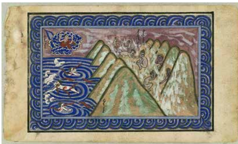
Figure 19. Folio page from another illustrated manuscript, depicting the suffering of beings in hell.

In figure 19 belonging to a different manuscript with the exact same narrative, we see a more crudely executed illustration. Those born in the Hell of Blood are also depicted in the far right corner of the folio, swim in their individual pools of blood but are not tortured with tridents. Their facial expressions appear calm in comparison to those in figure 18. To the left of the Hell of Blood is one of the cold hells. Perhaps due to the illustrator's lack of artistic talent, the suffering beings in this cold hell appear to be smiling. In the upper left corner, Molon Toyin stands on a cloud that covers the lower part of his body, with his palms raised.