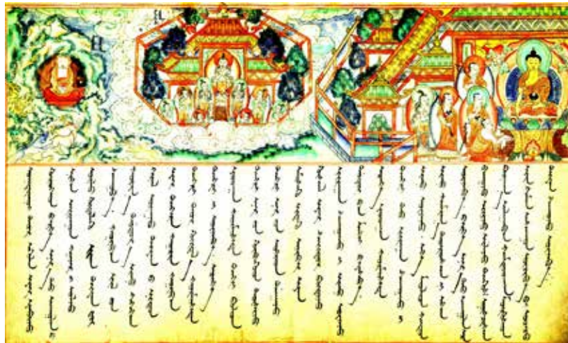
Figure 14 (folio 17). Scenes depicting Molon Toyin's meditation, his father in a celestial palace, and Molon Toyin in the presence of the Buddha Śākyamuni.

In the story, after Queen Molun dies within seven days, Molon Toyin places his mother's coffin inside the home, invites many monks to perform ritual prayers, and performs many good deeds on his mother's behalf. After the forty-ninth day since her death, he takes the coffin with her corpse to the mountain and buries it there. There he builds a home of hay where he sits to pray with single-pointed concentration for one hundred days in order to help his mother reach Buddhahood. Achieving the clear light of wisdom after practicing meditative concentration ( samādhi ) for three years on a mountain, Molon Toyin has a vision of his father in the Trayamstrimśa heaven, being venerated by the sons of gods and served by the daughters of gods. Not seeing his mother anywhere, he approaches the Buddha, asking for the place of her rebirth. In the same folio (folio 17; see figure 14), the illustrator depicts three scenes, from left to right, in which details not mentioned in the text are introduced: Molon Toyin meditating in a cave on a forested mountain inhabited by wild beasts (a tiger and wolves chasing a deer); Molon Toyin's father seated on a high throne within a celestial palace in Indra's heaven and being venerated by eight gods whose hairstyle resembles that of nobility in Chinese paintings; and Molon Toyin, standing on the right side of the Buddha seated on a lotus throne in a temple, with Ānanda and Śāriputra standing behind him (figure 14).