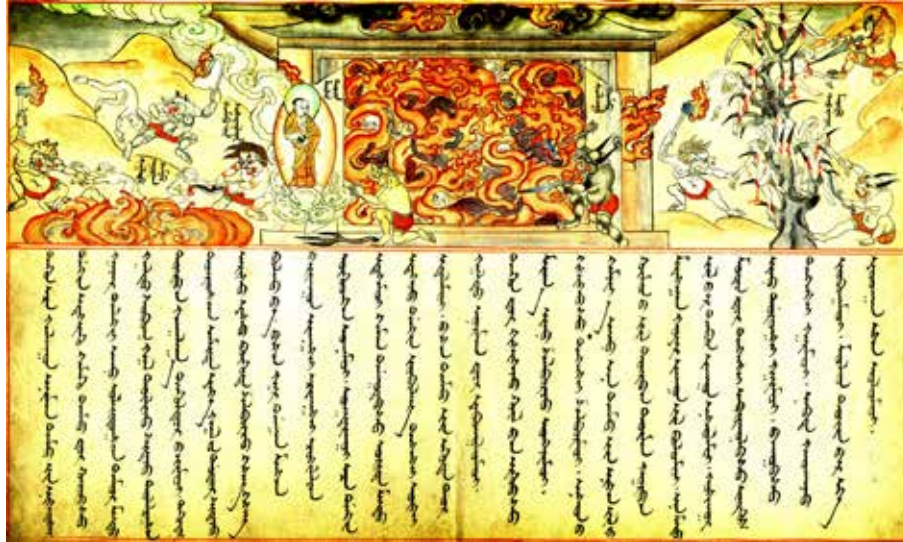
Figure 17 (folio 20). Scenes from different hells visited by Molon Toyin in search of his mother.

the illustrations themselves, as seen in figures 15, 17 and 18, the suffering beings portrayed in these illustrations are anonymous, perhaps because it is only the condition of each individual hell that matters to our illustrator. He intends to communicate horror and elicit fear and compassion in the audience through direct, visual perception of the chillingly horrific and explicit images of tortures and frightening hell beings that carry them out and at the same time articulate doctrinal concerns.