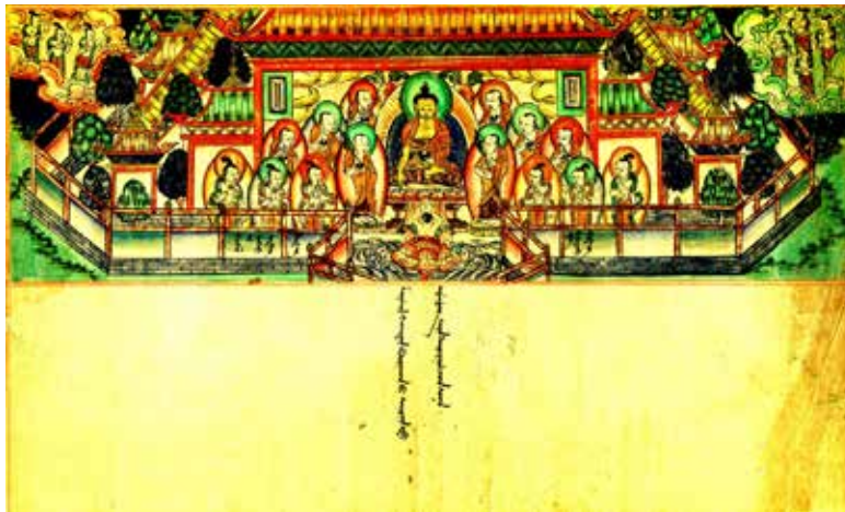
Figure 22 (folio 45). Queen Molun's birth from a lotus in the Buddha-field, emerging in the presence of the Buddha Śākyamuni.

The last image in folio 45 (figure 22) illustrates the satisfying conclusion, depicting Queen Molun's birth from a lotus in the Buddha-field, emerging in the presence of the Buddha Śākyamuni, who is seated on a lotus-throne, surrounded by the retinue of his disciples, some of whom are shaven monks, while others are garbed in yogis' clothing with their hair arranged in topknots.