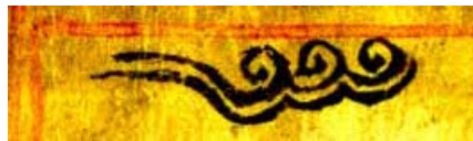
Figure 5. The colophon to the text expressing the author's prayer and commitment to the Dharma. Unless otherwise noted, this and all of the following figures are from the anonymous Ulaanbaatar illustrated manuscript.

Let us now turn to our anonymous Ulaanbaatar copy of the illustrated manuscript of a Mongolized version of the tale. The manuscript consists of forty-six folios measuring 42 x 25 centimeters, and is written on a thin, soft, white Russian paper without watermarks, the type of paper that became available in Mongolia for the first time in the second half of the nineteenth century. Each folio of the manuscript is framed by a double red line. The upper section of the folio contains illustrations; the lower section, which contains the main text, is unevenly painted with yellow aquarelle. The manuscript lacks a title page, and its page-long colophon reveals neither the name of the illustrator, author, or person who commissioned it nor the place and time of its production, which is not unusual in manuscript reproductions of popular literature intended for the masses. The folio of the colophon, which is somewhat damaged at the bottom edge, begins with an homage to the holy teacher ( blam-a ) Buddha ( burqan ), who is accompanied by his retinue, and it continues with the author's confession of sins and his intention to engage in wholesome deeds in the future. An ornamental mark ( bir ya ) placed in the top left corner of the recto side of the first folio is one of many Mongolian variants of the stylized marks that symbolically represent the syllable om and that often designate the beginning of the manuscript (see figure 5).