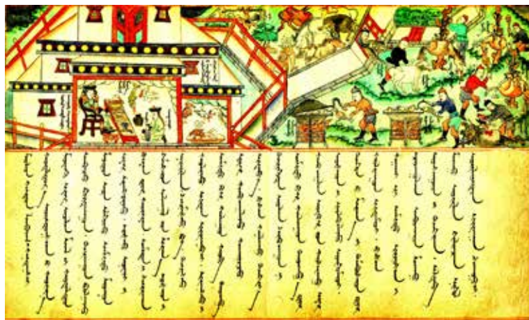
Figure 9 (folio 5). Queen Molun having her servants use cruel methods to slaughter animals for her consumption.

In the same illustration, Queen Molun's servants are depicted as commoners, wearing nomads' black knee-high boots and simple, short jackets and commoners' hats, as they boil live birds and fish, suspend live domestic and wild animals from trees, and beat them with clubs in accordance with her commands to satisfy her perverse appetite. Their clothing and work differ from that of indoor servants dressed in portrayed in several preceding images. The pictorial representation of the servants' dress and their outdoor labors and Queen Molun's decadent condition in the palace accentuates the sharp contrast between these two social classes. The artistic expression of this illustration is situated within historical as well as social contexts. The pictorial portrayal of people and events in this illustration is filled with discrete narratives not mentioned in the text and plays an important role in structuring the story's received meaning (figure 9).