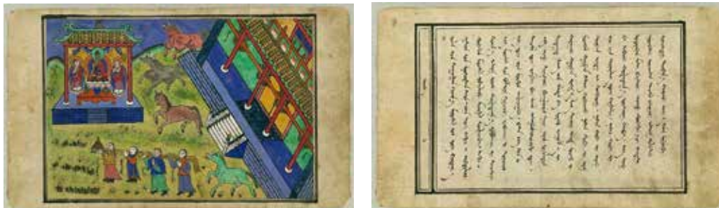
Figures 3 (left) and 4 (right). Folio pages with separated illustration and texts.