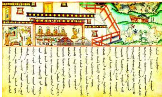
Figure 13 (folio 13). A scene depicting Queen Molun's death and funeral.

The illustration in folio 13 shows birds eating Queen Molun's corpse as it lies in a coffin. Some monks recite prayers for her and another monk paints an image of the Buddha at Molon Toyin's request. Queen Molun's clothing, hat, and boots are hanging on a wooden frame next to the yurt in front of the palace (figure 13). None of these details are mentioned in the text accompanying these illustrations in folios 11 and 14. The text only informs us that Queen Molun died seven days after she lied, swearing to Molon Toyin: "If I slaughtered animals and did not perform any wholesome deed, may I get a serious disease and die from it within seven days!"