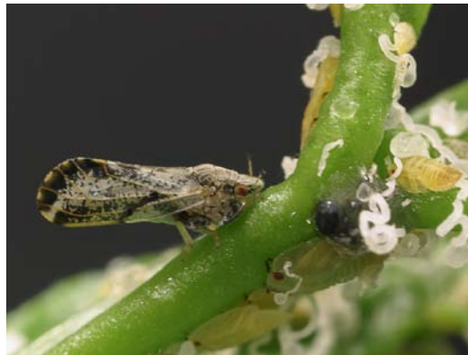
Figure 1. Asian citrus psyllid adult and nymphs.

Valley of Texas on potted nursery stock (orange jasmine) from Florida (French et al. 2001). The Asian citrus psyllid could invade California at any time, with most likely sources of infestation being Florida, Mexico, or Asia. There were 170 interceptions of Asian citrus psyllid at U.S. ports on plant material (primarily Murraya and citrus) from Asia from 1985 to 2003.