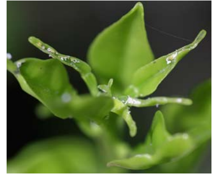
Figure 10. Twisted tips of new citrus flush due to psyllid feeding.

In addition, as Asian citrus psyllid feeds, it injects a salivary toxin that stops terminal elongation and causes malformation of leaves and shoots (fig. 10) (Michaud 2004). A single psyllid nymph feeding for less than 24 hours on a citrus leaf causes permanent malformation of that leaf. Overwintering adults aggregate on newly forming citrus leaf buds where they feed and mate. Often, initial infestations of Asian citrus psyllids are highly aggregated on individual trees within citrus orchards. This aggregation and feeding causes distortion of the leaf buds that provides improved oviposition sites. Citrus flush is often severely damaged (figs. 11 and 12), resulting in the abscission of the leaves and shoots (Halbert and Manjunath 2004) or malformed mature leaves (fig. 13). Mature trees can tolerate this damage since the loss of leaves or shoots is only a small portion of the total tree canopy. Nursery trees and new plantings may require chemical protection.