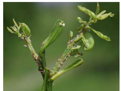
Figure 12. Malformed citrus leaves due to psyllid feeding.