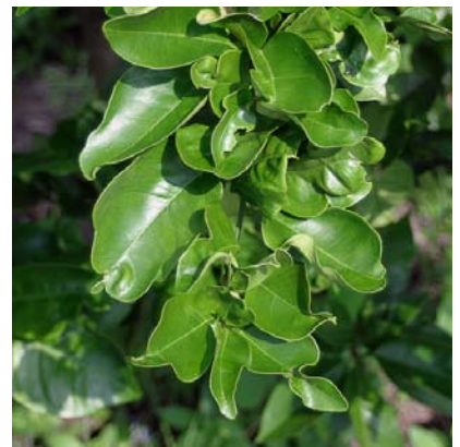
Figure 13. Distorted citrus leaves due to previous psyllid feeding.