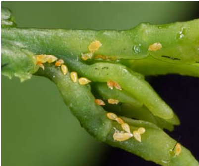
Figure 6. Psyllid eggs and hatching nymphs.