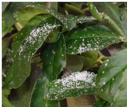
Figure 20. Honeydew, sooty mold, and waxy tubules produced by psyllids.