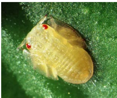
Figure 7. 5th instar psyllid nymph.

Citrus greening disease was first detected in the United States in Florida in 2005. It is found throughout Asia, the Indian subcontinent and neighboring islands, the Saudi Arabian peninsula, and since 2004 in the São Paulo state of Brazil. The citrus greening pathogen is transmitted by psyllid vectors, grafting, and possibly by citrus seed. A disease-free citrus budwood program combined with detection and eradication of Asian citrus psyllid are essential components of the program that protects the California citrus industry from citrus greening disease.