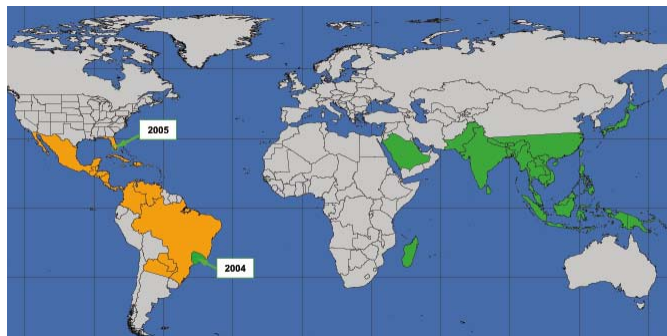
Figure 2. Worldwide distribution of Asian citrus psyllid alone (orange) and the psyllid in combination with the Asian form of greening disease (green). Illustration by G. H. Montez.