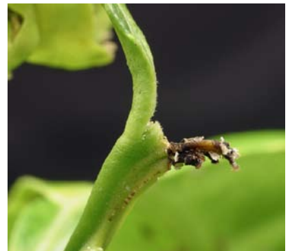
Figure 11. Burnt tip of citrus foliage due to psyllid feeding.