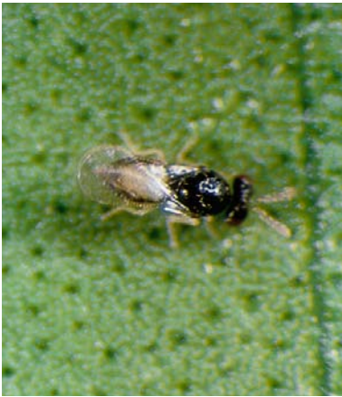
Figure 24. Tamarixia radiata parasitic wasp.