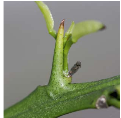
Figure 18. The characteristic body tilt of the adult citrus psyllid.