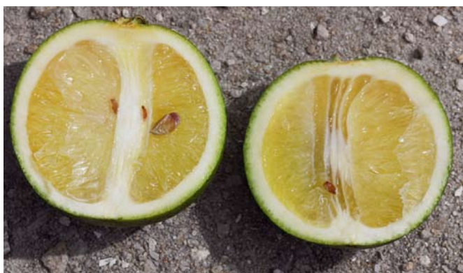
Figure 16. Small, lopsided fruit, dark seeds, and rind that does not color properly due to greening.