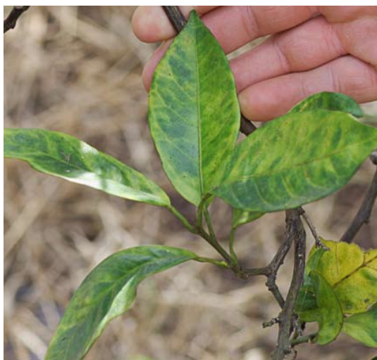
Figure 15. Chlorosis of citrus leaves due to greening caused by L. asiaticus .