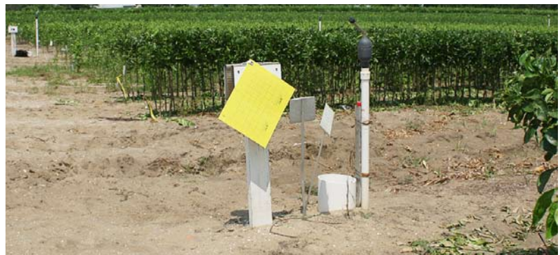
Figure 22. Yellow sticky card for adult psyllid detection.