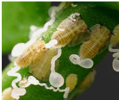
Figure 8. Waxy tubules produced by nymphs.

Asian citrus psyllid females lay their bright yellow-orange, almond-shaped eggs on the tips of growing shoots or in the crevices of unfolded “feather flush” leaves (fig. 6). The number of eggs laid is dependent upon host plant. For example, a mean of 857 eggs per female was deposited on grapefruit, whereas a mean of 572 eggs per female was deposited on rough lemon. At 77°F (25°C), the eggs hatch in about 4 days (Tsai and Liu 2000).