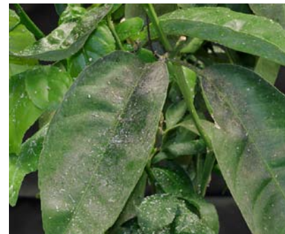
Figure 9. Sooty mold growing on the honeydew excreted by the nymphs.