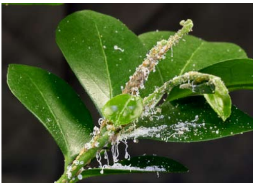
Figure 21. Heavy infestation of psyllids on Murraya .