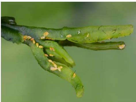
Figure 19. Psyllid eggs and nymphs tucked into crevices and folds.