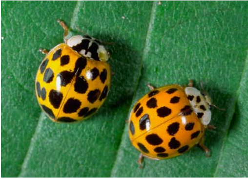
Figure 23. Harmonia axyridis coccinellid predatory beetles.