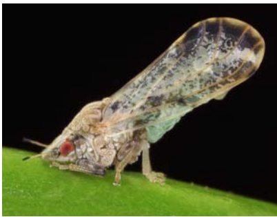
Figure 5. Psyllid adult feeding.