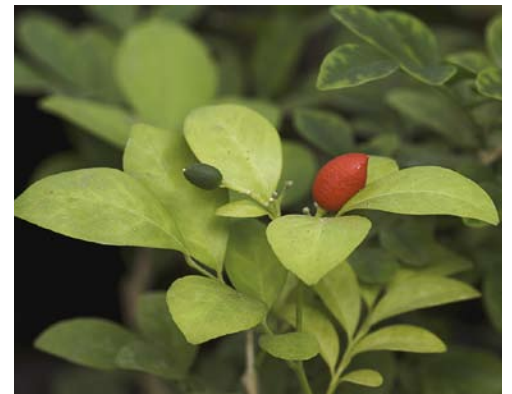
Figure 3. Murraya paniculata , orange jasmine.