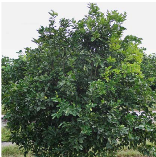
Figure 14. Yellowing of a quadrant of a citrus tree due to greening.

The Asiatic form of citrus greening disease is found throughout the warmer areas of Asia, India, and the Saudi Arabian peninsula (see fig. 2). In July 2004, both L. asiaticus and L. americanus isolates of citrus greening disease were detected in Brazil, where they were found to be affecting orchards in São Paulo state (Texeira et al. 2005). In 2005, L. asiaticus was detected in Florida. Citrus greening has not been found in California. The host range of L. asiaticus and L. americanus is limited to citrus and closely related relatives of citrus. Thus, disease monitoring efforts should be directed towards these plant species. If you suspect that you have trees infected with citrus greening, contact your local county agricultural commissioner’s office.