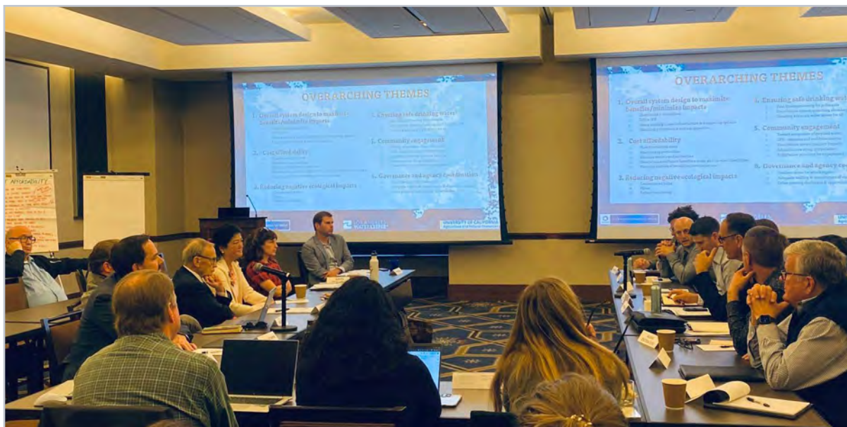
TAC participants at the February 22, 2024 convening