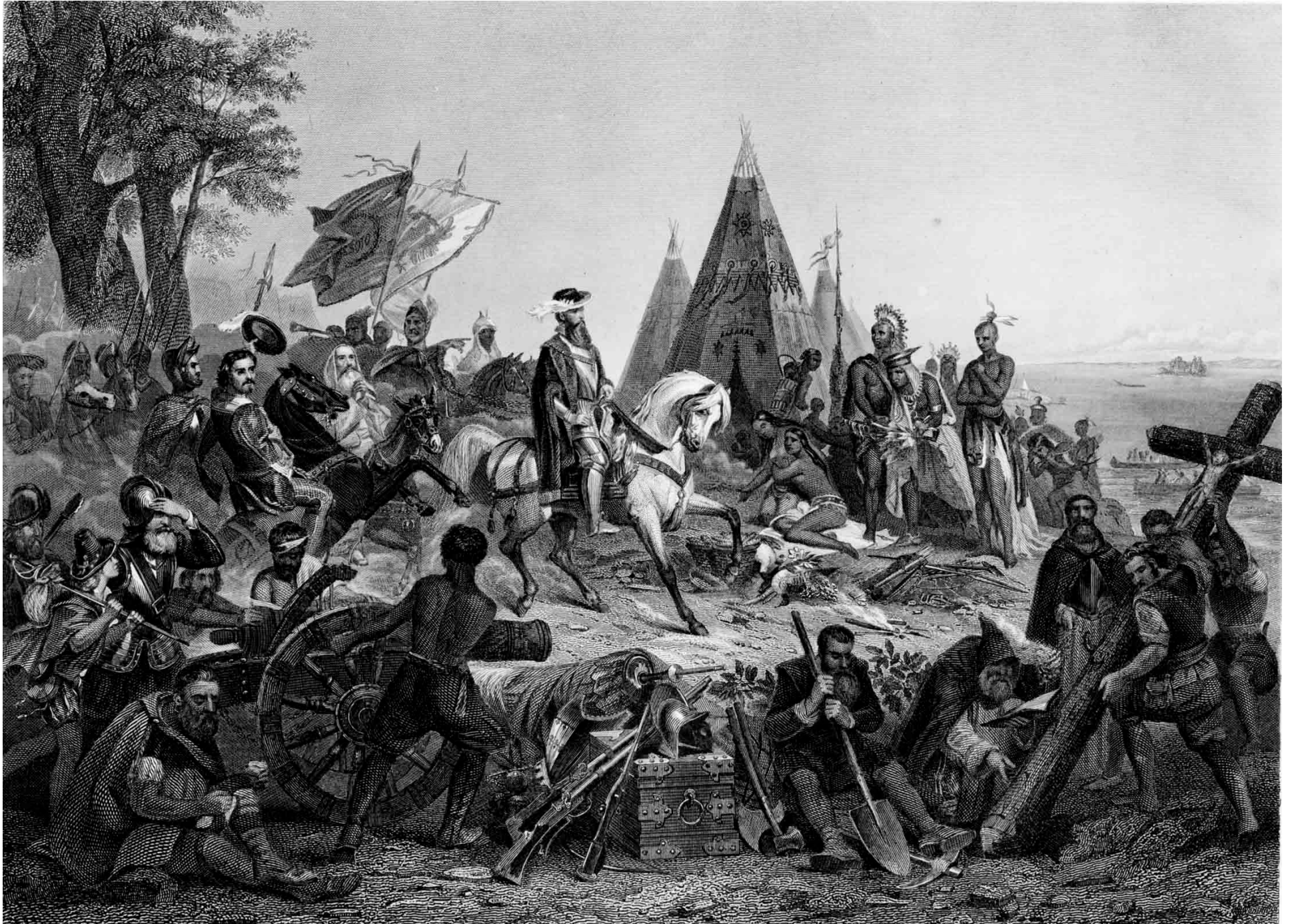
De Soto's Discovery of the Mississippi, 1541, published by Johnson, Fry & Co., 1858 (The Gilder Lehrman Institute)