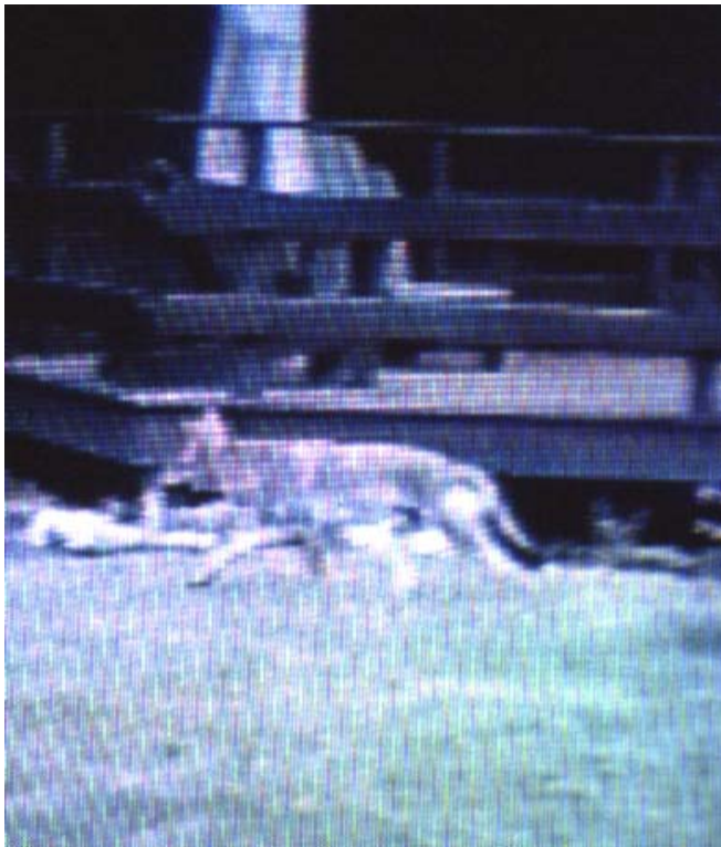
Figure 3. A coyote continued to visit the backyard of a San Clemente residence on a daily basis after it had stalked a 2-year-old child.