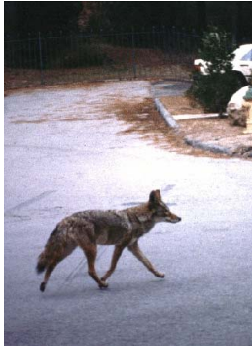
Figure 4. A coyote with little fear of humans is easily seen during daylight hours on an urban street in San Bernardino County, California.

daylight between 9:00 a.m. and 4:00 p.m. Most of the attacks have occurred within a few blocks of the urban fringe area where native brush is abundant or where open space, mandated to mitigate the negative affects of development, has provided brushy wildlife habitat islands surrounded by homes.