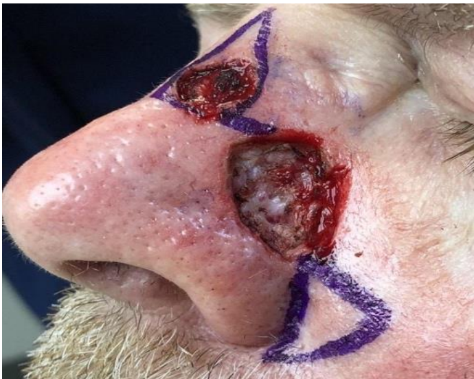
Figure 1. B) Application of the Burrow triangle technique to bridge and connect the two nasal defects, facilitating reconstruction.