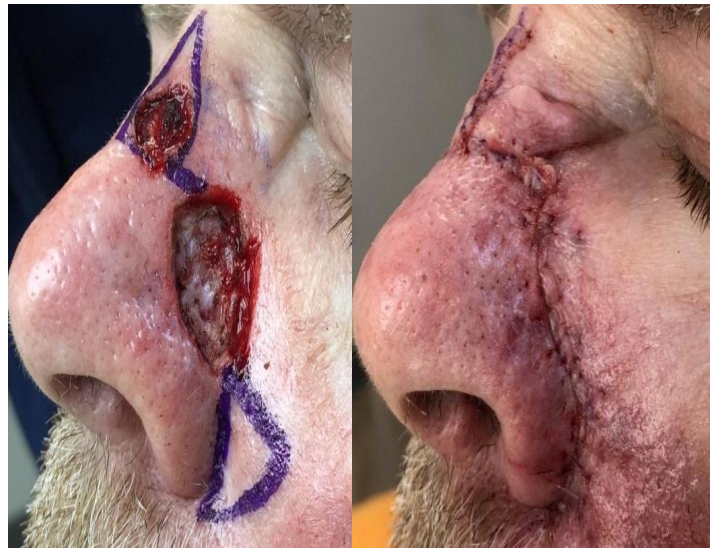
Figure 1. C) Closure of the nasal defects ensuring proper alignment and symmetry.