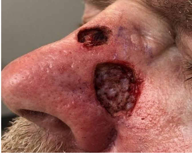
Figure 1. A) Evolution of nasal repair utilizing the Burrow triangle technique. Initial defect following resection with Mohs surgery, highlighting the extent of tissue removal.

and are both located above the alar crease. Yet, it remains applicable for alternative surgical areas when traditional repair options, such as primary closure, flaps, or grafts, are insufficient because of factors such as limited tissue availability, defect size, or location. This approach offers a valuable tool for addressing complex nasal defects, emphasizing the importance of precision and creativity in achieving optimal outcomes for patients.