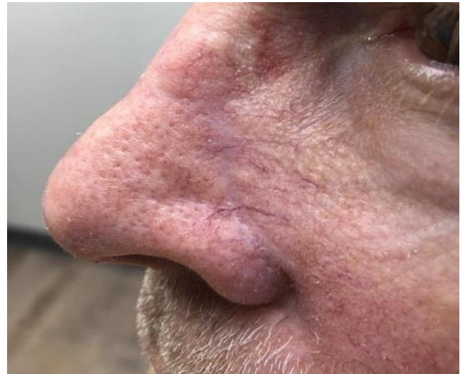
Figure 1. D) Final outcome of nasal repair, demonstrating no lower eyelid ectropion, satisfactory cosmetic appearance, and functional restoration.