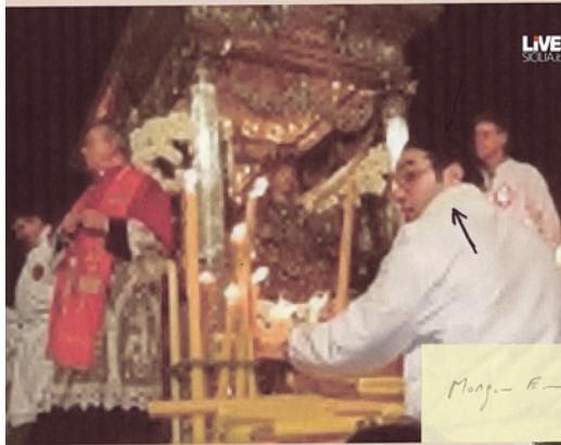
Fig. 5: Members of the Santapaola family