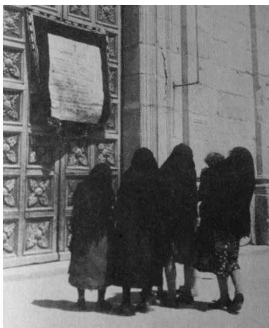
Fig. 1: Elegy in commemoration of Calogero Vizzini's death in Villalba, 1954

A holy picture was distributed among the population on the day of Di Cristina's funeral. 17 The closing lines read: "The enemy of all injustices/ he showed with words and deeds/ that his mafia was not criminality/ but respect for the law of honor/ defense of every right/ great-heartedness/ It was love." This funeral card was couched in language similar to the elegy pinned to the entrance doors of the church of Villalba in July 1954 in commemoration of the death of mafia boss Calogero Vizzini (Fig. 1). 18