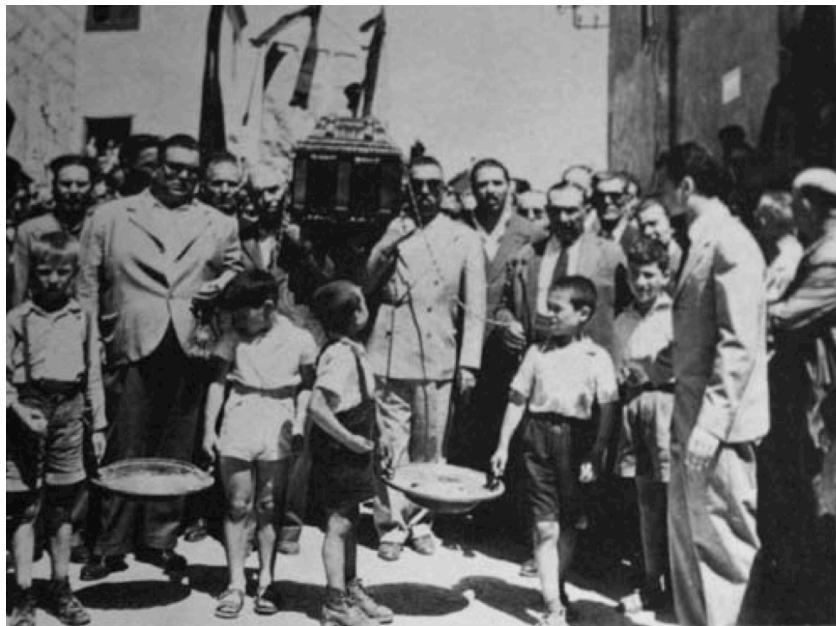
Fig. 2: Funeral of Vizzini. Genco Russo in attendance (center-right, wearing a black tie)

The deferential attitude of the attendees demonstrates the significant public role that Vizzini had played for a broad spectrum of the population. At the same time, it shows his close connection with other powerful “men of honor” in Sicily. For example, Giuseppe Genco Russo, mafia boss of Mussumeli, in the province of Caltanissetta, can be seen in the front line of the funeral procession (Fig. 2). 23 Widely considered the successor of Vizzini, Russo similarly represented the typical figure of mediator and social entrepreneur who had built up a position of power during his mafia career by infiltrating public agencies and forging privileged relationships with important individuals. 24