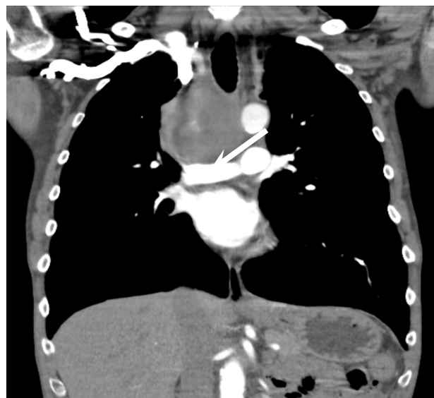
Figure 2. Coronal computed tomography of paratracheal mass with right anterolateral tracheal involvement.

A 52-year-old male presented to the emergency department with chest pain, shortness of breath and hemoptysis that had been worsening over the past two days. Past medical history included a history of non-small cell lung carcinoma, which he had completed radiation therapy approximately four months prior and was currently undergoing chemotherapy. Significant vitals upon presentation included a respiration rate of thirty-six breaths/min and peripheral oxygen saturation measuring 80%. Physical examination revealed a cachectic male appearing older than his actual age, alert and oriented to person, place and time with rhonchi throughout his lung fields and decreased breath sounds on the right. He was started on non-invasive biphasic positive airway pressure with mild improvement of clinical status. An anteriorposterior chest radiograph was performed and prior computed tomography of the chest was reviewed (Figures 1, 2). Computed tomography of the chest was also repeated on the day of presentation (Figure 3).