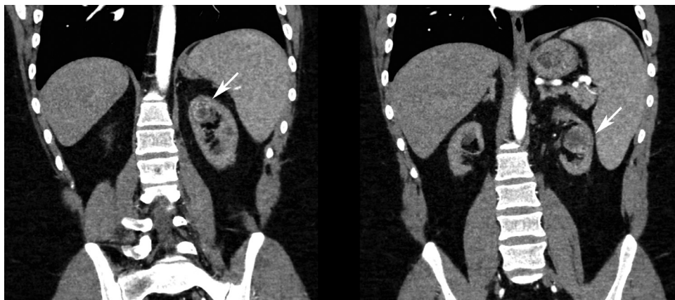
Fig. 3 – Arterial phase contrast-enhanced coronal CT images demonstrate enhancing lesions in the left kidney upper pole and midzone with central hypoattenuating areas.

a propensity to develop both benign vascular tumors and epithelial neoplasms [1]. Currently, imaging does little to alleviate the challenge. Ultrasound findings are nonspecific and do not aid in distinguishing renal hemangiomas from other tumors. It has been suggested that central hypoattenuation on computed tomography, which was present in our case, may indicate hemangioma as a differential consideration [5]. Given the lack of definitive imaging characteristics, biopsy or excision is necessary for final diagnosis. Our patient