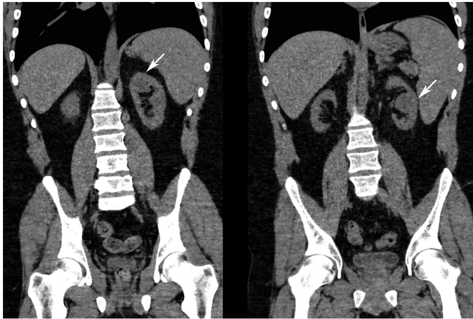
Fig. 2 – Noncontrast coronal CT images demonstrate hypoattenuating lesions in the left kidney upper pole and midzone.