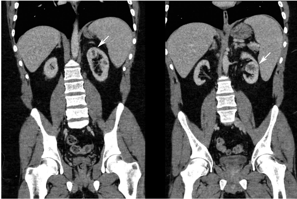
Fig. 4 – Portal venous phase contrast-enhanced coronal CT images demonstrate enhancing lesions in the left kidney upper pole and midzone with central hypoattenuating areas.