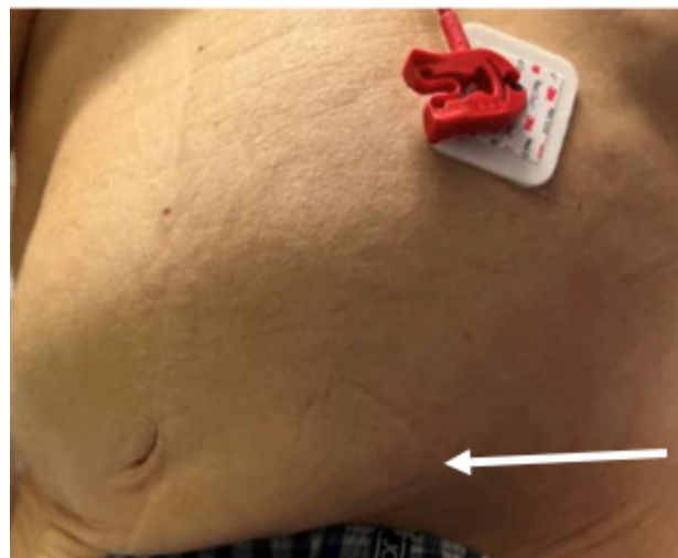
Image 1. Physical examination demonstrating a grossly distended and palpable left inguinal mass (white arrow)

Incarceration of a portion of the stomach is a rare cause of gastric outlet obstruction, with fewer than 20 cases documented in the literature. 1 The rarity of stomach-containing groin hernias is remarkable, considering that the lifetime incidence of groin hernias is estimated to be between 27-43% for men and 3-6% for women. 2 The inferior portion of the stomach attaches to