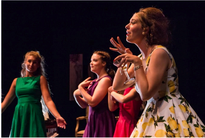
Figure 4.2 “Idealness”

Halfway through the monologue, the woman begins to lose her “idealness” and her internal thoughts explode out taking over her entire being as she no longer can uphold the qualities of the unattainable “ideal” woman. She has a moment where she gets stuck repeating the same word over and over as if a record was skipping, until she bursts out of the trance with a dramatic and loud representation of how ridiculous these expectations are. As she continues to laugh at herself and this conceptual woman she describes, she talks about aging, beauty ideals, and growing up with a false understanding about love and men. The dancers slowly leave her making their way to sit at the dining table, reconnecting with their faceless expressions. As the woman reminisces in her childhood dreams singing Disney songs, and talking about what a letdown it has been waiting for those expectations to become realities, her anger builds once more. She yells into the mirror, “Mirror, mirror on the wall, who? Who, is the fairest of them all?” This shift from a more reflective and humorous state of expression to the anger that she directs into the mirror brings the monologue to its close. She delivers her remaining few lines into the mirror, and returns to her chair where it all began, and will begin over again. Before she sits down, she walks to