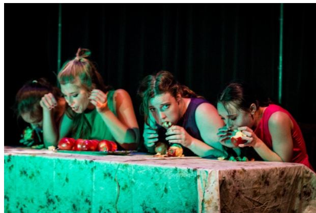
Figure 4.8 Shame

During this feast, the woman hums a lullaby while rocking the cradle. She then bumps into the record player once more causing it to scratch back into the ending of “She Ain’t Built That Way” from the first scene. The dancers slowly wipe their mouths and once again slowly sink out of their chairs and crawl out from under the table. This time they walk directly to the mirror and one by one undress