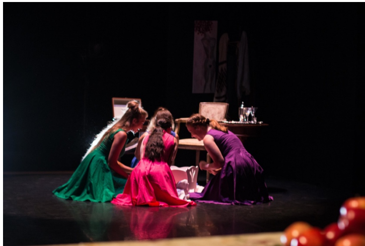
Figure 4.1 The Cradle

A slightly haunting lullaby plays as the lights brighten. The woman is standing in front of the mirror crying with her back to the audience. After realizing she is not alone, she begins to speak to the audience as if they were guests in her home. She welcomes them and provides a short home walk through as any “ideal” housewife would be expected to do. She even introduces the audience to her mirror. She asks, “Mirror, mirror on the wall, who is the fairest of them all?”