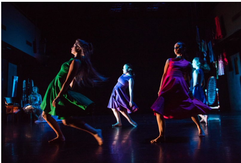
Figure 4.4 Hips

The audience listens to the recording without knowing it is about riding horses and therefore are given freedom to connect the words to whatever subject comes to mind. In this case the words “riding” and “intercourse” provide a sexual tone against the dancers moving through the space with their hips. Without being told the subject title of the recording, it allows the audience to form their own connections of the movement and words to the sexualization of females in American culture.