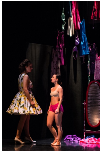
Figure 4.9 Stripped

leaving their dresses to pile up on the floor. Once again they form the pile of bodies, but this time without their clothes. The return to the song and the piling of bodies, represents the consistent fight for equality women have been circling around throughout feminist history.