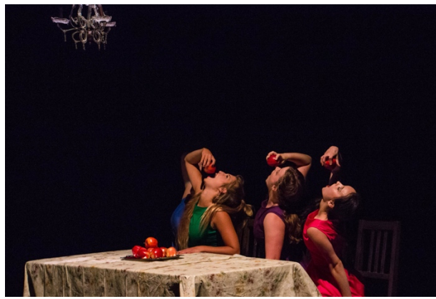
Figure 4.7 Apples

After the recording ends, silence fills the space. There are apples in front of each dancers’ place at the table. They slowly begin to eat the apples. This quickly turns into a feast-like frenzy as they ravage their apples, spilling bites out of their mouths and around them.