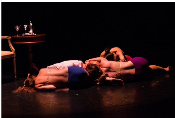
Figure 4.10 Backlash

The lights fade down on the pile of female dancers and the woman in her home returns once more to the mirror. She begins to cry again. As the lights fade out, the sound of her sobbing leaves a sense of loneliness and continued struggle.