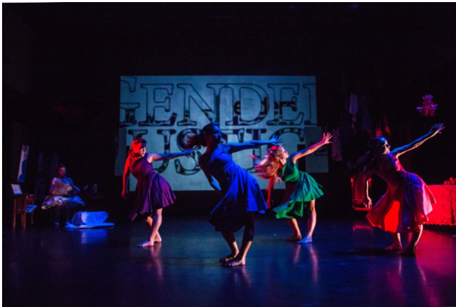
Figure 4.6 Revolution

While this recording plays the dancers charge towards the audience with more athletic and aggressive dynamics. They begin lifting one another and pushing each other forward in support to take a stand. There are pictures of stereotypical gender lists, geological and political graphs of the United States, revolutions, equality signs, and pages of the constitution being projected through the dancers' bodies and onto the back wall creating a political and revolutionary scene.