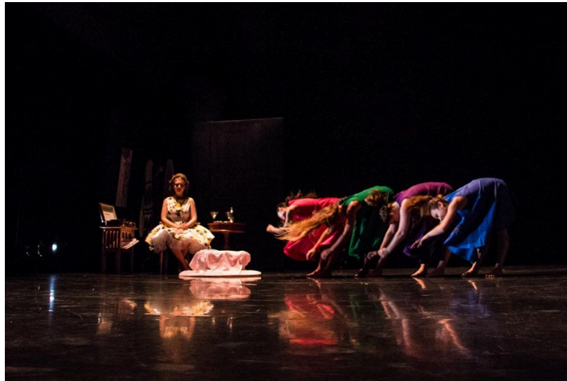
Figure 4.3 Dress

multiple bumps in the music as the needle attempts to find the beginning of the song. The dancers attempt to get to the back of the stage but fall to the ground with every skip in the record.