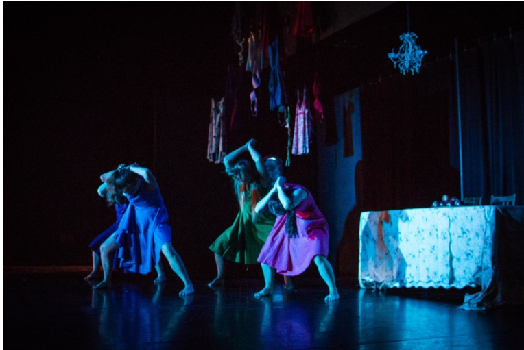
Figure 4.5 Wolf Whistle

The sound of a woman walking in heels begins to play, slowly at first and then picking up speed. Ashley, the “ideal” woman, walks back and forth to the amplified clicks of her heels. With every heel click, the dancers perform gestural movements that progressively quicken until barely performable. During this violent movement of their bodies repeating the same gestures at a quickening pace, a wolf whistle 5 sounds. Hearing both the woman’s heels quickening and the wolf whistle creates a tense, fearful, and cold atmosphere. They end in the same prayer position as they began while the heel clicks and whistling fades away. The crackle sound of the record player looping around itself returns and the dancers come forward once again brushing off their dresses. They begin moving together building a rhythm against the loop of the vinyl. A recording plays of radical feminist Gloria Steinem’s “Address to the Women of America,” originally heard at the founding of the National Women’s Political Caucus in 1971: