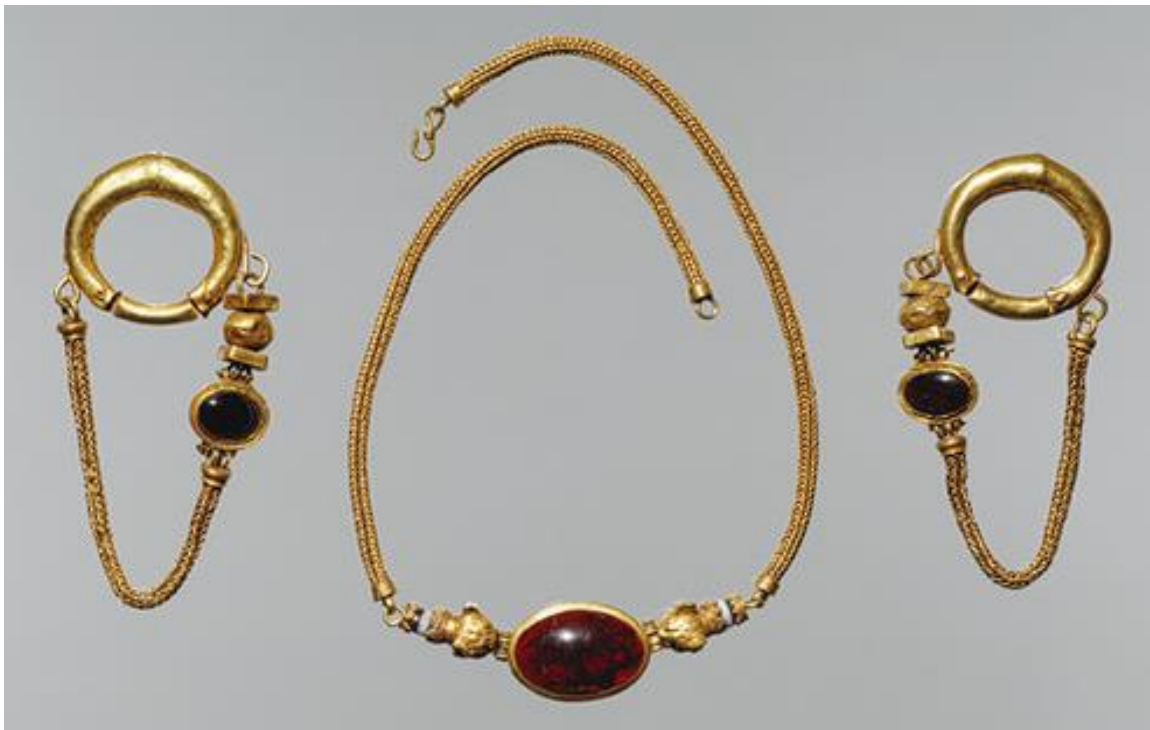
Figure 5: Hellenistic Necklace and earrings, 1 st century BCE, gold, garnet, and agate, Metropolitan Museum of Art, New York.