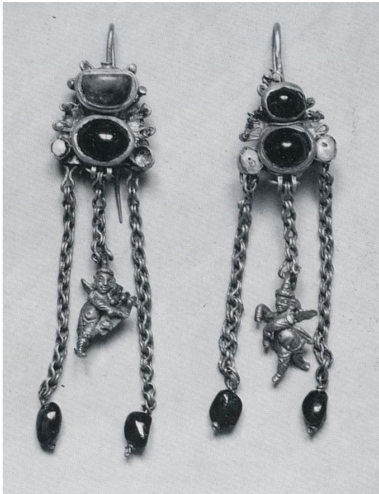
Figure 3: Eros Earrings, 2 nd century BCE, gold and garnet, Hamburg Museum, Hamburg.