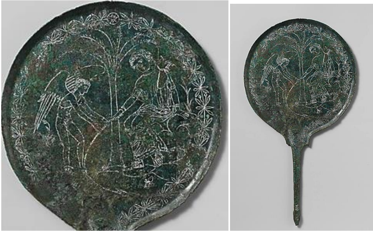
Figure 2: Mirror, ca. 350 BCE, bronze, Metropolitan Museum of Art, New York.