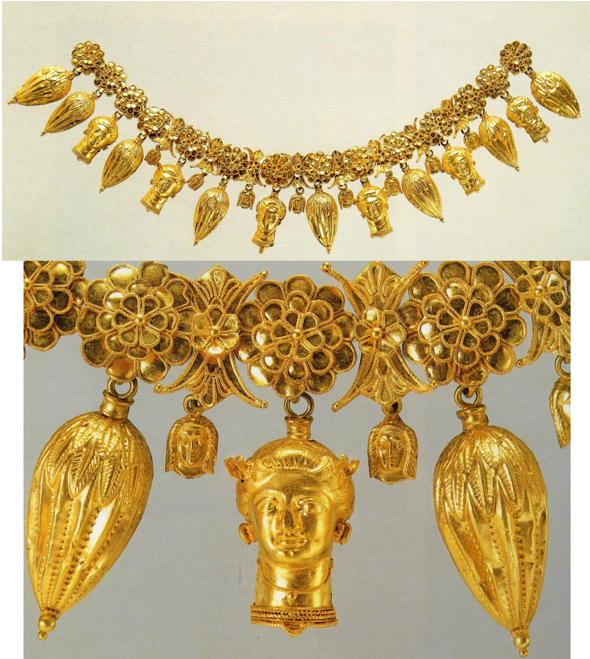
Figure 1: Necklace with Rosettes, lotus and blossoms, vase-shaped pendants and female heads, c. 350 BCE, gold, British Museum, London.