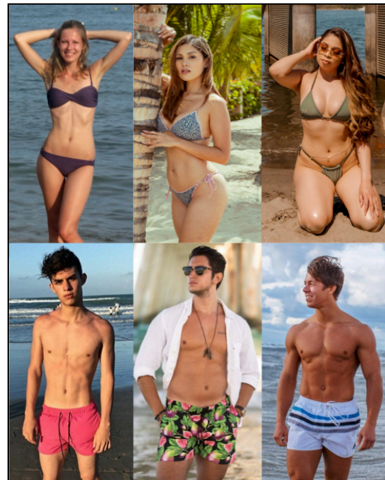
Figure 1: Examples of images picked for each body type category

Based on the responses obtained, 5 pictures were selected depending on the scores they received on the thinness-muscularity/curvaceousness spectrum for each gender and each body type (see Figure 1). Overall, female stimuli were rated lower than male stimuli on the thin-curvaceous scale. Participants did not use the full scale when scoring female bodies, avoiding high thinness or curvaceous rates. For males, scores of 0-3 were considered thin ( M=3.21 , SD=0.67 ), scores 4-7 were considered average ( M=5.32 , SD=0.71 ), and scores 8-10 were considered curvy or muscular ( M=8.16 , SD=0.67 ). For females, scores from 2-3 were considered thin ( M=3.12 , SD=0.68 ), scores 4-5 were considered average ( M=4.93 , SD=0.63 ), and scores 6-7 were considered curvaceous ( M=6.92 , SD=0.35 ). To determine the prevailing beauty ideal, female and male images that approached a score of 10 on the scale were taken to represent the prevailing beauty ideals in the population. The female body ideal was evaluated as average in the first assessment ( M=4.48 , SD=1.80 ) and the closest to the beauty ideal ( M=7.51 , SD=1.89 ) The male body ideal was rated as muscular ( M=7.62 , SD=1.85 ) and closest to the beauty ideal ( M=8.28 , SD=1.73 ) (see Figure 2).