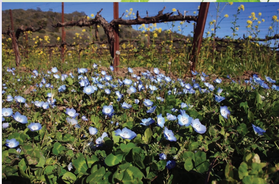
Research shows that low-statured, self-reseeding legumes and grasses may be good cover-crop choices for North Coast vineyards. Above, baby blue bells ( Nemophila insignis ) and subterranean clover grow in a Lake County organic vineyard.

During the past 15 years, cover crops have become widely used in California as a vineyard floor management practice (McGourty 1994, 2004). Cover crops protect vineyard soil from erosion, improve soil fertility and tillage, serve as habitat and food for beneficial insects and mites, and provide firm footing during wet weather. They are