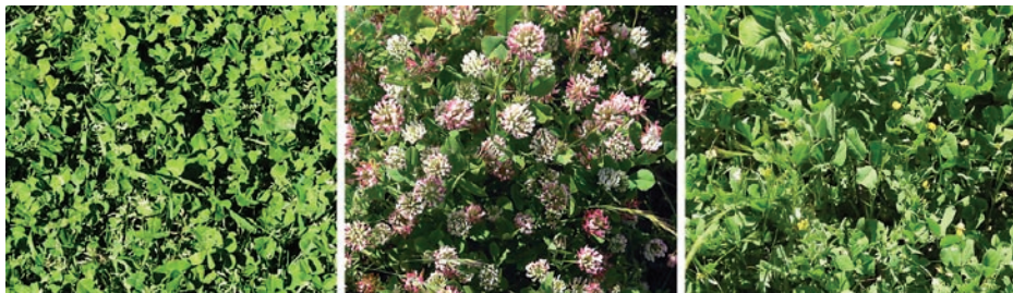
Twenty-two cover-crop cultivars were compared with an unseeded control. Left, subterranean clover; center, balansa clover; and right, bur medic.

self-reseeding annual legumes such as medic, subterranean clover and other clover species were useful in vineyards as cover crops, even if annual reseeding was required.