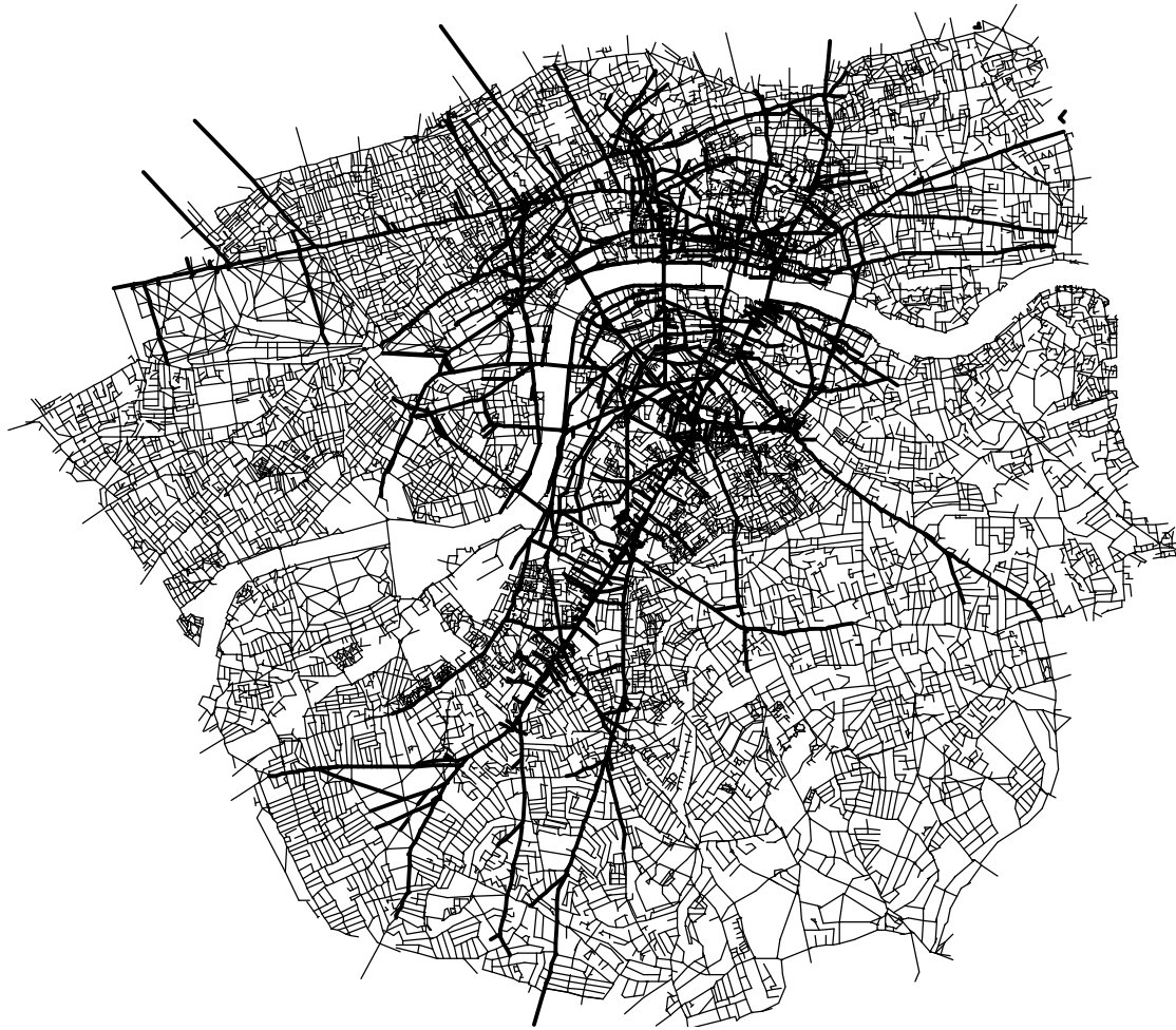
FIGURE 1 Study areas in context, angular segment model.