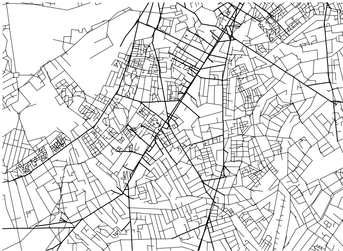
FIGURE 2 Angular segment map of Stockwell study area.