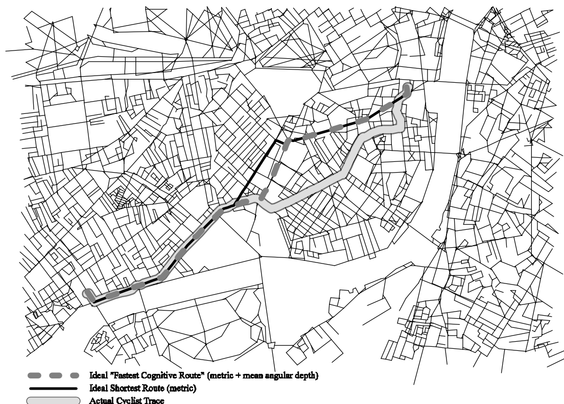
FIGURE 5 Example of shortest path vs. “fastest cognitive route” overlay analysis