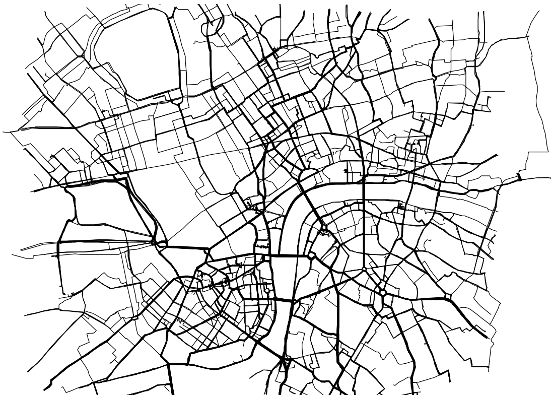
FIGURE 4 Cyclist movement traces.

The second phase of the study used gate counts of cyclist volume from the Stockwell and the Elephant and Castle areas of London. The Stockwell data set included 46 separate observation gates collected between 12:00 PM and 20:00 PM during weekday and weekend periods. The Elephant and Castle data set included 64 separate observation gates collected over a twelve hour period between 8:00 AM and 20:00 PM on both weekday and weekends. These gates counts were cleaned to exclude gates on cul-de-sacs, gates in housing estates, and gates with no observed cyclists. Analysis was also only conducted on weekday counts during this study, but the presence of weekend cyclist volumes offers the potential for future research which could capture leisure and non-work based trips with more detail.