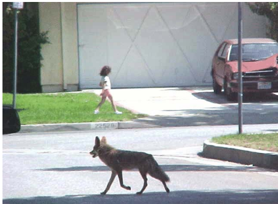
Figure 1. An urban coyote strolls through West Hills, a suburb of Los Angeles, California, in July 2002.

The typical activity pattern of coyotes in the absence of human harassment seems to be largely crepuscular and diurnal, but when predator control activities are undertaken, coyotes shift their activity mainly to nighttime to avoid humans (Kitchen et al. 2000). Conversely, a lack of human harassment coupled with a resource-rich environment that encourages coyotes to associate food with humans can result in coyotes losing their “normal” wariness of humans. Howell (1982:21) stated that this sort of environment, which had developed in hillside residential areas of Los Angeles County, produced “abnormal numbers of bold coyotes.” At that time, he noted it was not unusual for joggers, newspaper delivery persons, and other early risers to observe 1 to 6 coyotes daily in such residential areas. By the late 1990s, Baker noted that coyotes in this area commonly could be observed feeding in late mornings and afternoons, and residents saw coyotes in yards, on streets (Figure 1), and on parks and golf courses throughout the day (Baker and Timm 1998). More recently, coyotes have been observed during mid-day on school grounds. Such behavioral changes appear to be directly associated with increased attacks on humans.