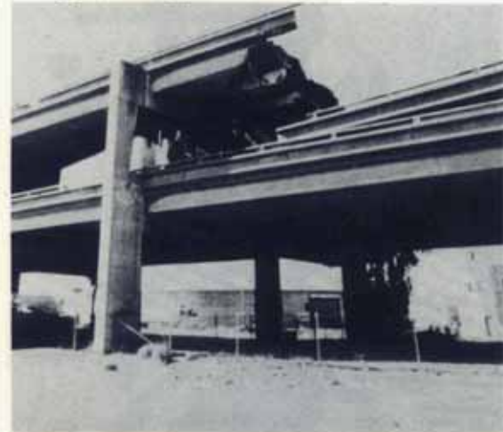
Damaged section of Oakland Cypress structure.