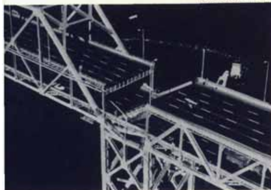
The section of the Bay Bridge upper deck fell when a bridge footing slipped out of place.

We are thus led to conclude that, to a large degree, we can rely on the autonomous and adaptive responses of the many components of the metropolitan system and that we are not dependent upon central command-and-control management when natural disaster strikes. Individuals, employers, suppliers, and the various private and governmental organizations can be trusted to accommodate spontaneously. If supplied with sufficient resources, including sufficient infrastructural resources, the metropolitan system seems to be remarkably resilient.