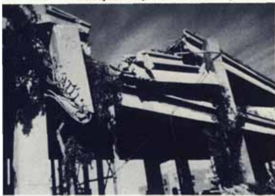
The double-decked section of I-880 in Oakland collapsed, crushing motorists on the lower deck.