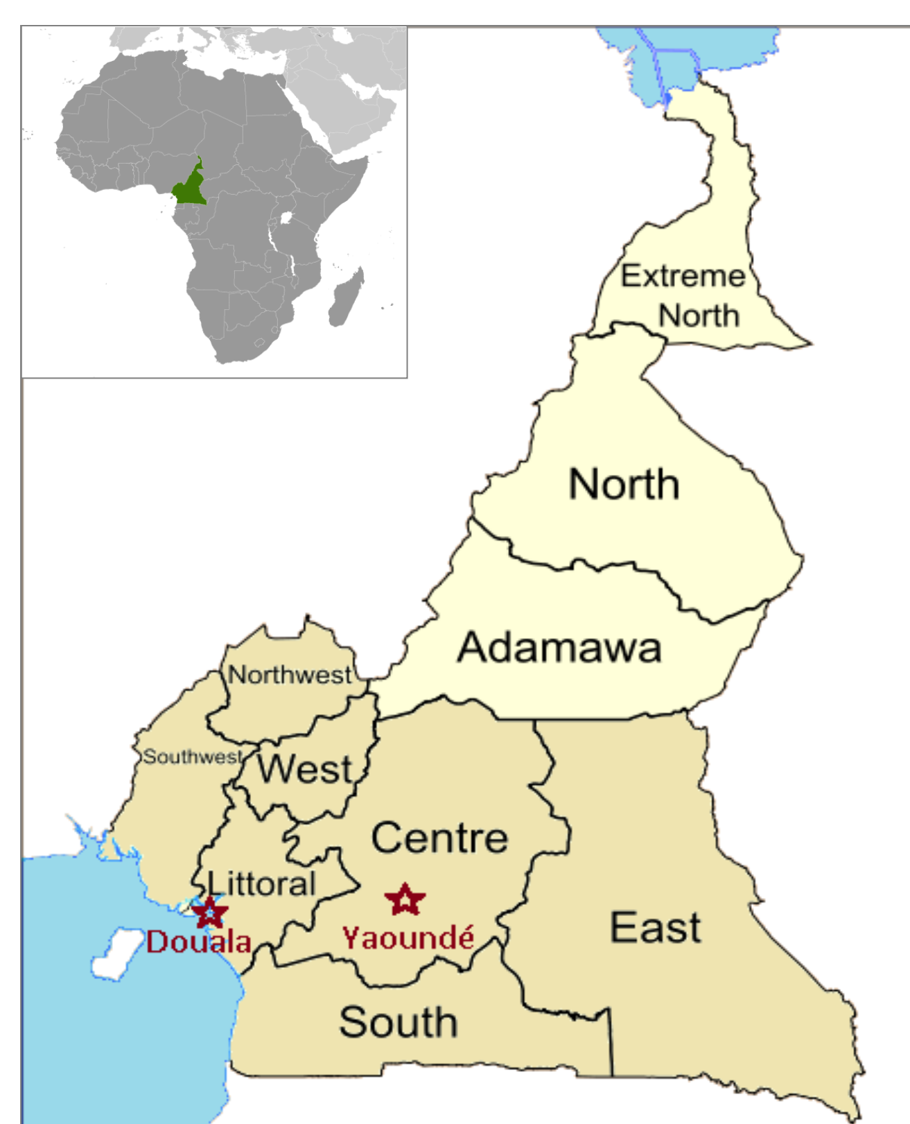
Figure 1: Cameroon's urban centers, Yaoundé and Douala