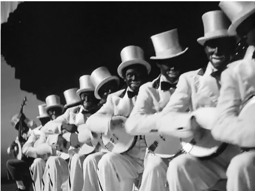
Fig. 4.6: Two frame-breaking moments in the minstrel show from Babes on Broadway : Judy Garland at the conclusion of “Franklin D. Roosevelt Jones” (top) and Mickey Rooney’s banjo choir in “Alabama Bound” (bottom).