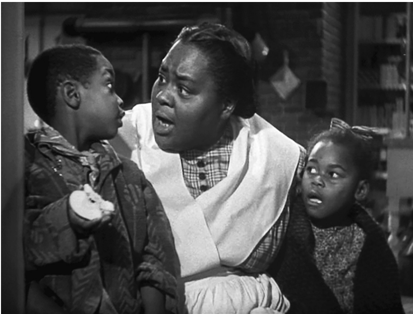
Fig. 4.3: Top : Bing Crosby's Jim (as "Tom"), Marjory Reynolds's Linda (as "Topsy"), and bottom : Louise Beavers's Mamie, performing "Abraham" in Holiday Inn (1942).