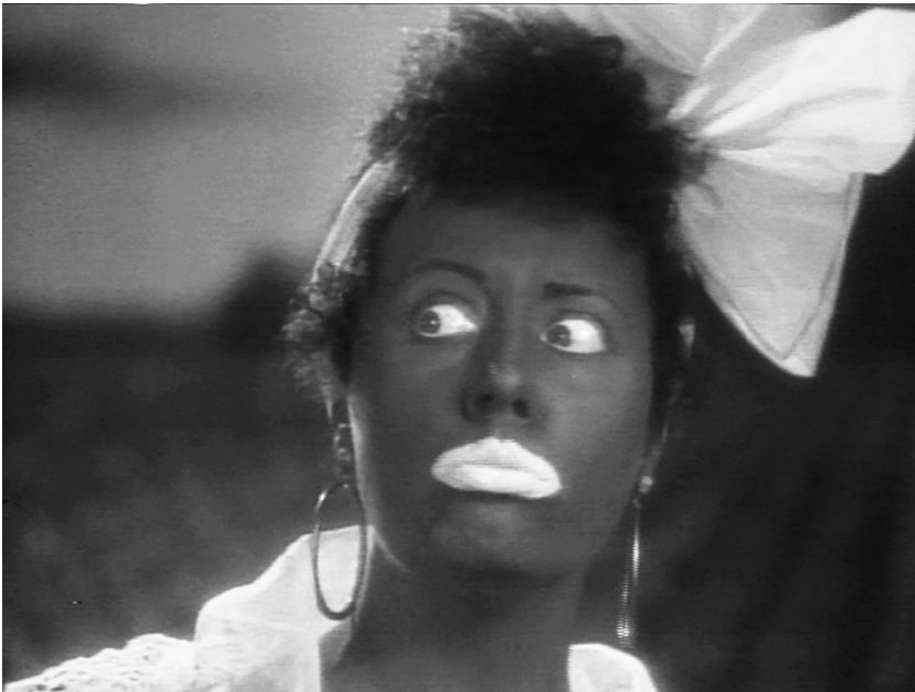
Fig. 4.2: Irene Dunne's Magnolia burning cork over a candle flame on the dressing room table while blacking up ( top ), and then performing "Gallivantin' Around" ( bottom ) in Show Boat (1936).