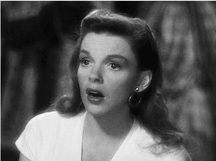
Fig. 4.5: Judy Garland lit and framed in Meet Me in St. Louis (top: "The Trolley Song") and in The Pirate (bottom: "Evening Star" verse of "Mack the Black").