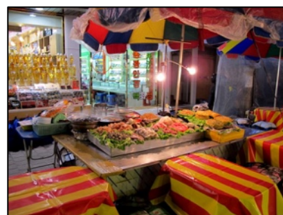
Figures 10a (top), 10b (bottom left), 10c (bottom right). The traditional market ( chaelaesichang ).