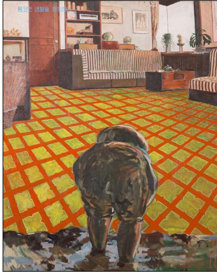
Figure 8. Lucky Monorium Guarantees Prosperous Life (1981) by Kim Jeong-Heon. Source: 2001 gift from Lee Ho-jae, GanaArt to the Seoul Museum of Art (SeMA). Used with permission.

with a fancy floor decoration brand called Lucky Monorium, the advertisement copy of which is found in the corner: “Lucky Monorium Guarantees a Prosperous Life.” This scene of middle-class prosperity is directly in tension with the image of a poor farmer standing in a rice field in the foreground. Perspectival manipulation, achieved through resized patterning of the flooring, creates an optical illusion that amounts to creating a sense of alienation, suggesting what the farmer figure feels while looking at this middle-class home yet being perpetually distanced from it (figure 8).