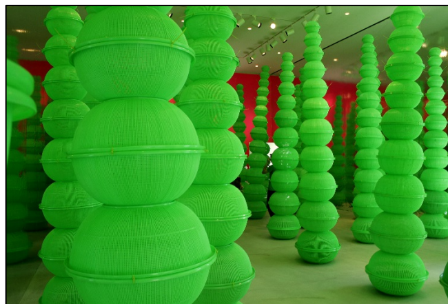
Figures 1a (top) and 1b (bottom). Plastic Paradise (1997) by Choi Jeonghwa. All images of Choi's work are used with permission of the artist.