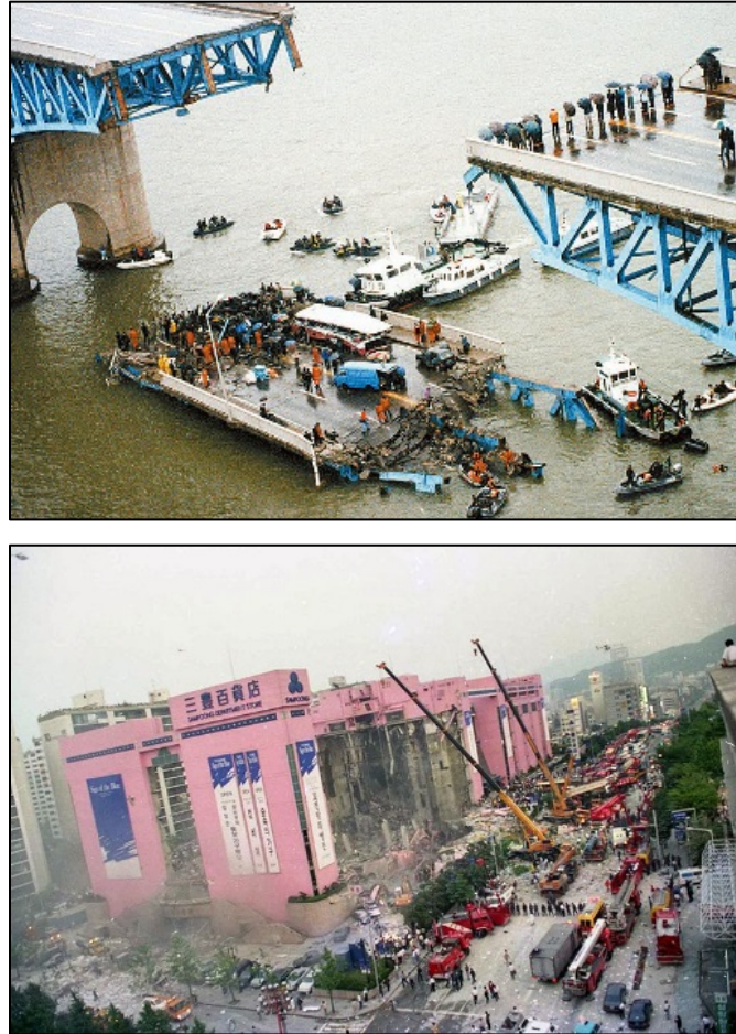
Figures 7a (top). Collapse of the Söngsu Bridge (1994). Source: Yonhap News Agency. Figure 7b (bottom). Collapse of the Samp'ung store (1995). Source: Yonhap News Agency.

being “inevitable” for a late-developing country, which provided fertile ground for corruption and other forms of misconduct. Korean developers of large-scale public building projects since the 1970s were also regularly involved in illegally shifting to inferior building materials after safety certifications had been issued. Bribing corrupt bureaucrats, who in return turned a blind eye to this practice and to the routine negligence of safety maintenance, was also commonplace among these developers. 16