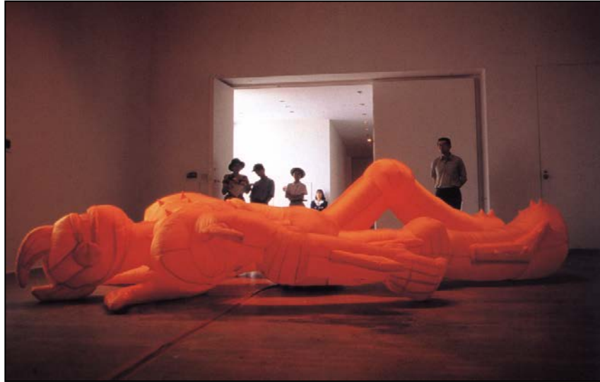
Figure 5. About Being Irritated—The Death of a Robot (1995) by Choi Jeonghwa.