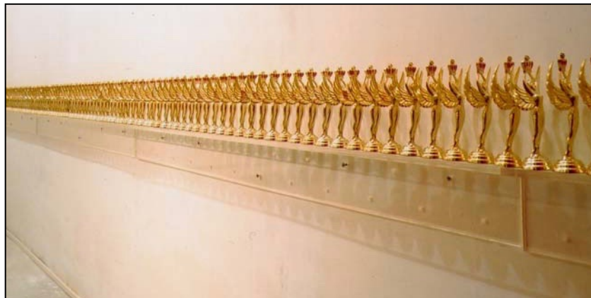
Figure 6. Plastic Paradise, Encore, Encore, Encore (1997) by Choi Jeonghwa.

Another way Choi's installations narrate the story of the masses' optimism in a manner pertinent to the era of accelerated growth is through monumentalizing the utopian values innate in industrial mass-produced goods. Choi samples and assembles the consumer goods in a way that accentuates their abundance, versatility, and expendability as a condition of the utopia that industrialization has enabled through its capacity for infinite production and replication of these objects. It is also possible that the sampled goods are narrating, more specifically, how mass consumption has become a way of life in post-World War II industrial liberal society across the globe; the consumer goods have become the primary means by which this society achieves its social goal of egalitarianism (Cohen 2003; Rupert 1995, 160; Williams 1982). Put another way,