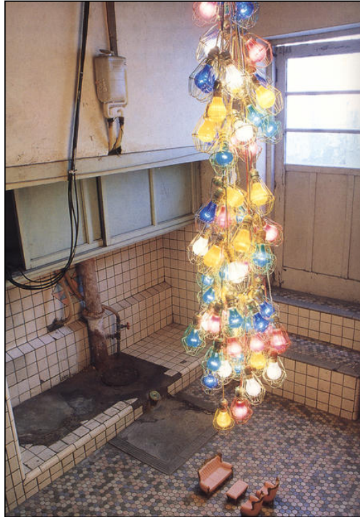
Figure 2. Color, Color, Color (1994) by Choi Jeonghwa.