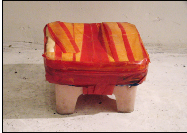
Figure 9. The reformed small plastic stool found on the streets of Seoul.